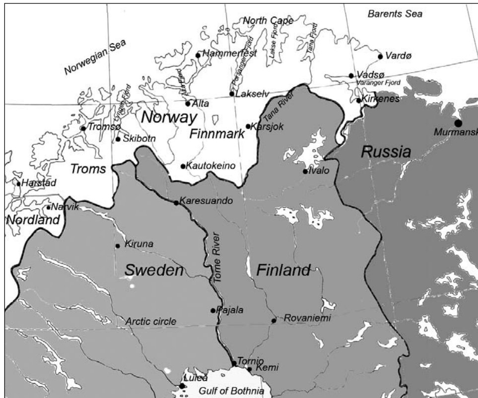
Map of North Scandinavia