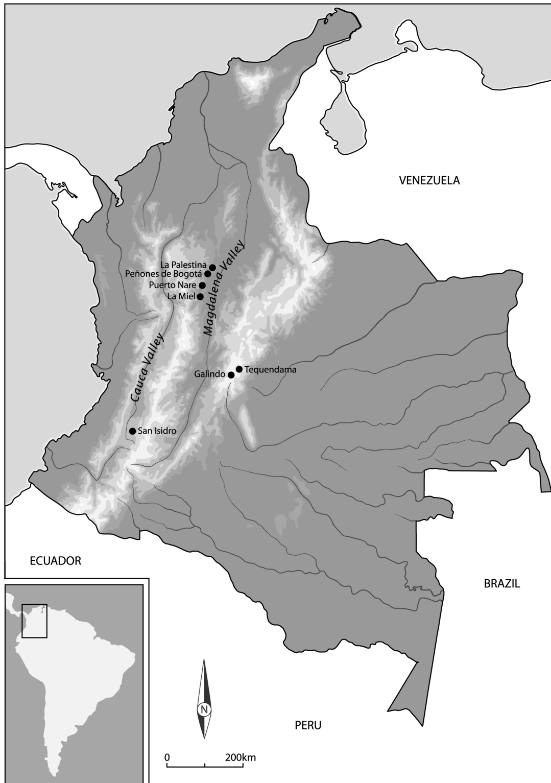
Fig. 3.1 Geographical map of Colombia. Selected sites.