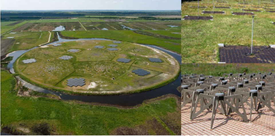
Figure 1.3: The LOFAR superterp near Exloo, Netherlands, showing several stations with both HBA and LBA antennae (left). Individual LBA (top right) and HBA (bottom right). (credit LOFAR/ASTRON).

further eight stations in a number of other European countries. The signals from the antennas are digital, meaning that many beams or pointings can be formed simultaneously. This, combined with its large instantaneous field-of-view, makes LOFAR an extremely efficient instrument for surveying large areas of the sky. The electronic nature of the beams makes LOFAR highly flexible. In terms of frequencies, a total bandwidth of up to 95 MHz is available. The Dutch array provides resolutions of a few tens of arcsec at 60 MHz and a few arcsec 150 MHz, unprecedented for these frequencies. The inclusion of international baselines gives sub-arcsecond resolution in both the low and high bands. Fig. 1.3 shows an image of the central collection of six stations, the ‘superterp’, and close-up images of individual LBA and HBA dipoles.