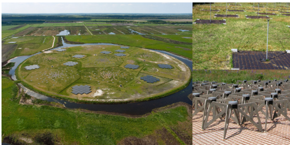
Figure 1.3: The LOFAR superterp near Exloo, Netherlands, showing several stations with both HBA and LBA antennae (left). Individual LBA (top right) and HBA (bottom right). (credit LOFAR/ASTRON).

further eight stations in a number of other European countries. The signals from the antennas are digital, meaning that many beams or pointings can be formed simultaneously. This, combined with its large instantaneous field-of-view, makes LOFAR an extremely efficient instrument for surveying large areas of the sky. The electronic nature of the beams makes LOFAR highly flexible. In terms of frequencies, a total bandwidth of up to 95 MHz is available. The Dutch array provides resolutions of a few tens of arcsec at 60 MHz and a few arcsec 150 MHz, unprecedented for these frequencies. The inclusion of international baselines gives sub-arcsecond resolution in both the low and high bands. Fig. 1.3 shows an image of the central collection of six stations, the ‘superterp’, and close-up images of individual LBA and HBA dipoles.