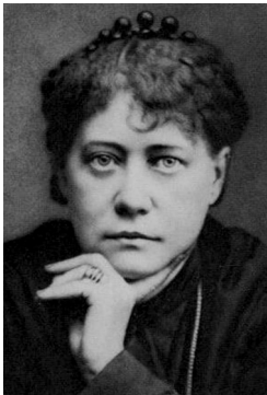
14 Invented traditions are so called new and non 'authentic' traditions, Hobsbawm & Ranger 1983.