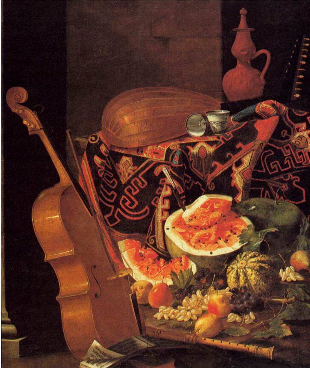
Figure 3.10. Cristoforo Munari (1667–1720), Still-Life with Musical Instruments and Fruit . Collection: Palazzo Pitti, Florence. 623

A simpler-looking instrument like that in the Lazzari of Figure 3.9, appears in at least three further paintings by Munari, two of which are seen reproduced as Figures 3.10 and 3.11. 622 The traits observed in the instruments depicted in Figures 3.9 and 3.10 suggest that if they are not Italian instruments, these recorders allude much more towards German design than anything else.