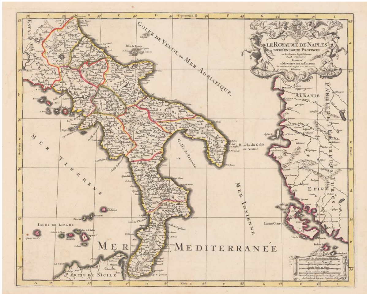
Figure 3.5. Le Royaume de Naples Divise en Douze Provinces sur les Memoires les plus Nouveaux. Par le Sr. Sanson [...] (Paris: Hubert Jaillot, 1696).

by the eighteenth century, with an estimated 400,000 508 (twice the population of Venice and four times that of Rome), then only exceeded by Paris.