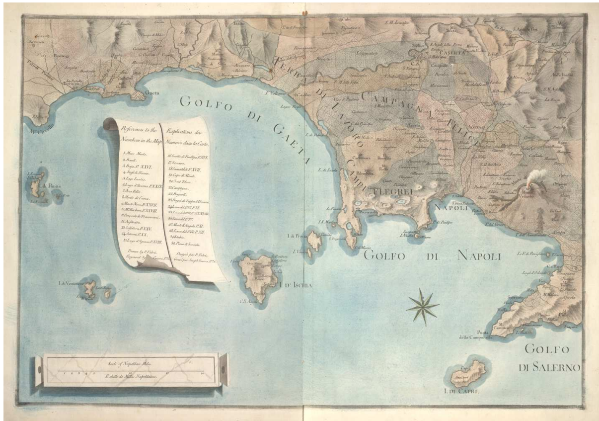
Figure 3.3. The Gulfs of Gaeta, Naples, and Salerno from Campi Phlegraei, Observations on the Volcanos of the Two Sicilies (Naples: Sir William Hamilton, 1776). 484

that grow around the Vesuvius as producing some of the best wines in Italy. 482 Goethe's impression of the area was less practically grounded: "Denke ich an Neapel, [...] so fällt es einem sowohl in der Erzählung als in Bildern auf, daß in diesen Paradiesen der Welt sich zugleich die vulkanische Hölle so gewaltsam auftut und seit Jahrtausenden die Wohnenden und Genießenden aufschreckt und irremacht." 483