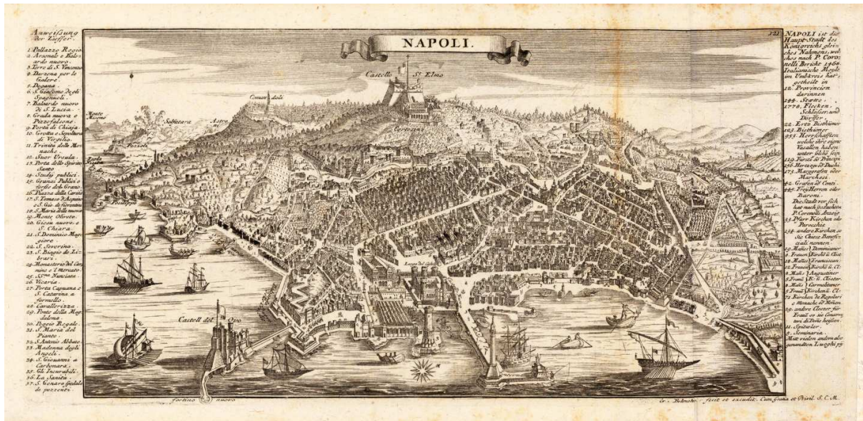
Figure 3.6. Napoli (Augsburg: G. Bodenehr 1704-20).

As in other major Italian cities, and especially after the Council of Trent (1545–1563), various confraternities were established in Naples for the mutual support of craftsmen, 526 including instrument makers. The first confraternity of musicians, Santa Maria degli Angeli, was created in 1569, but others were not founded until the middle of the seventeenth century. In 1649 the Congregazione de Musici was created in the church of San Giorgio Maggiore. By 1655 it numbered approximately 150 members. In 1667 the confraternity (or rather, what was left of it after the 1656 plague) was split between the string players and the wind players. The musicians of the Royal Chapel also had their own confraternity, named after Santa Cecilia, documented from 1655. 527