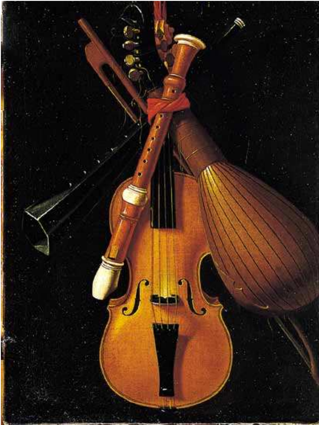
Figure 3.7. Cristoforo Munari (1667–1720), Panoplia musicale (c. 1707–1713). Collection: Firenze, Galleria Palatina. 618

Munari used this same recorder again in a still life, shown in Figure 3.8.