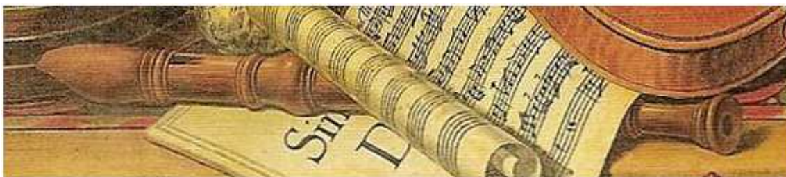
Detail of Figure 3.9.