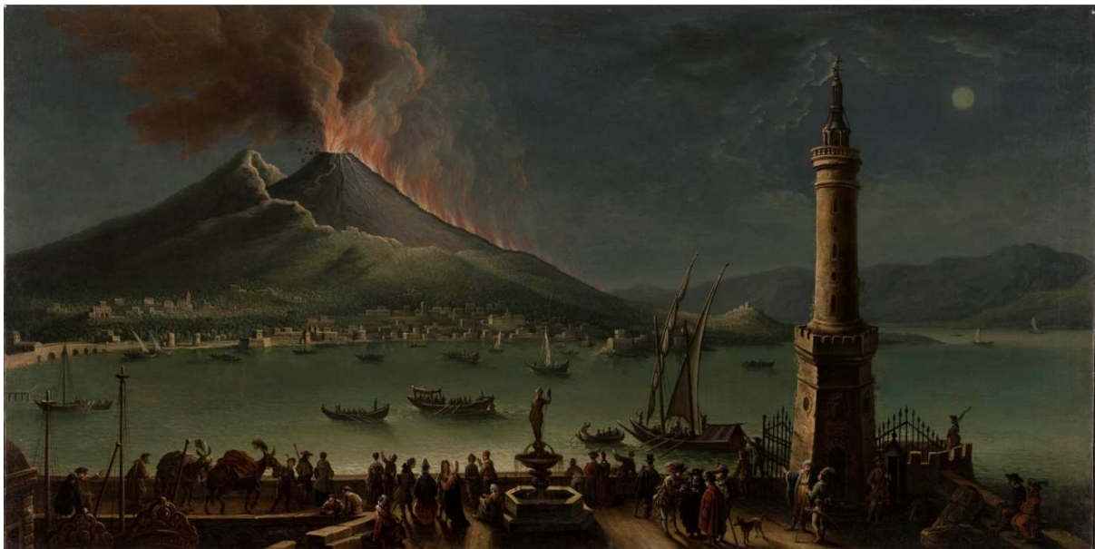
Figure 3.2. Anonymous (eighteenth century), Veduta del Vesuvio dalla lanterna del Moro con il ponte della Maddalena ed i sobborghi di Napoli fino ai Cappuccini di Torre del Greco . Collection: Unknown. 481

Between its foundation in the eighth century B.C. and 1759, Naples was Greek, Roman, Byzantine, Norman and Hohenstaufen, and also Angevin, Aragonese, Habsburg and Bourbon. The juxtaposition of such diverse cultures is still apparent in the various architectural and decorative styles as well as in the language the city (and region) preserves. The mere existence of its own language, Neapolitan, and its use and expression not only in daily life but also in music and literature, 480 further solidified Naples' foothold in gaining the reputation of exotic and unique. Mirroring the history of the city, the Neapolitan language draws from Latin, Spanish and Greek, with a colorful phonetic palette.