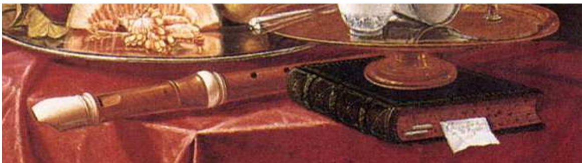
Detail of Figure 3.8.

The 'pear' on the head joint of the recorder in Figure 3.7 and 3.8 is comparable to that on the Edinburgh soprano by Castel (Cas.SPI.01), though in Munari's recorder it seems to be longer. The 'bulb' on the foot joint in Figure 3.7 resembles that of the Grassi