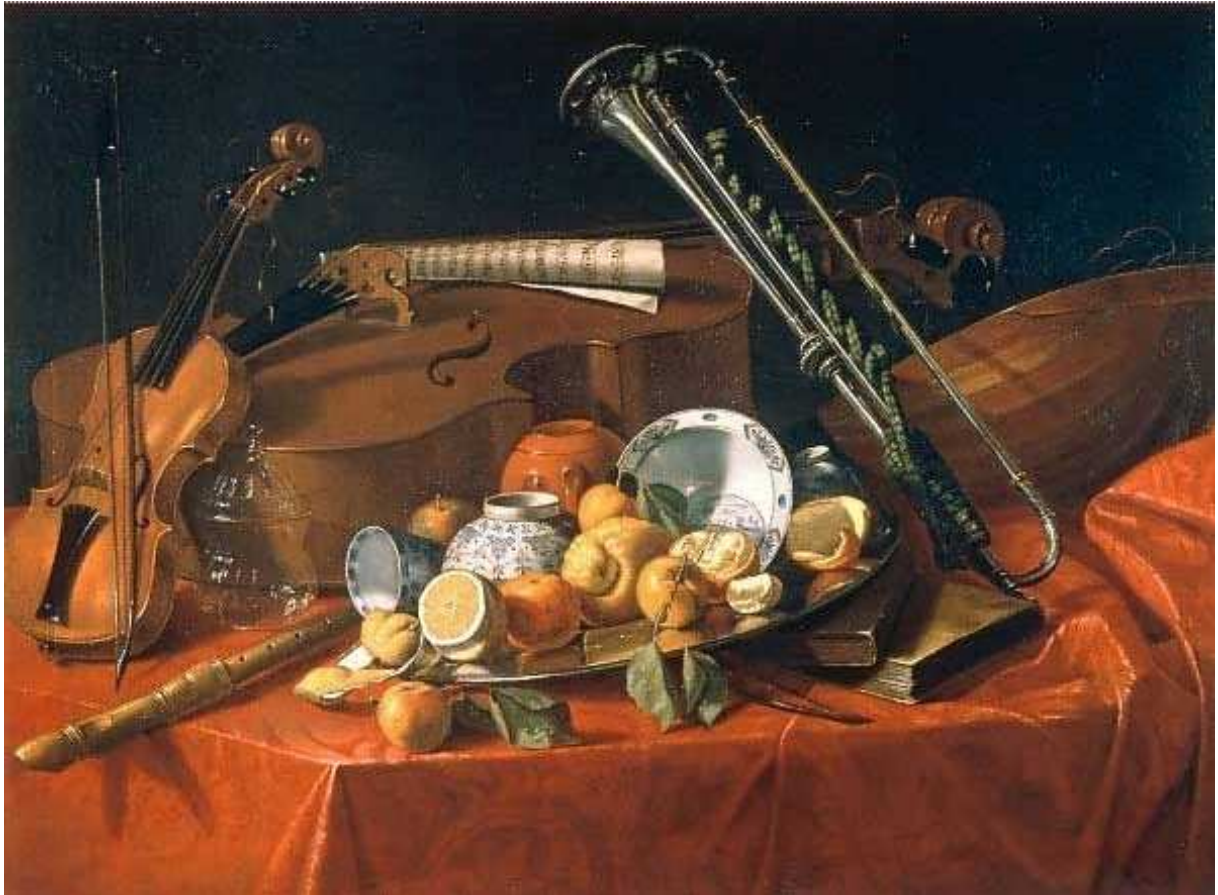
Figure 3.11. Cristoforo Munari (1667–1720), Still life with musical instruments . Collection: Galleria degli Uffizi, Florence. 624

On the problems related to trying to recreate real scenarios based on depictions, see the painting by Lazzari shown in Figure 3.12. The score in the center is Corelli's sonata Op. 5 No. 1. Below in the background, on the left hand corner, a one piece, renaissance looking recorder is depicted. The juxtaposition of a renaissance recorder with a Corelli sonata – a work that could not possibly have been played on that instrument – underscores the need to view iconographical references with an extra dose of caution. Taken literally, this painting may lead us to significantly wrong and misleading conclusions.