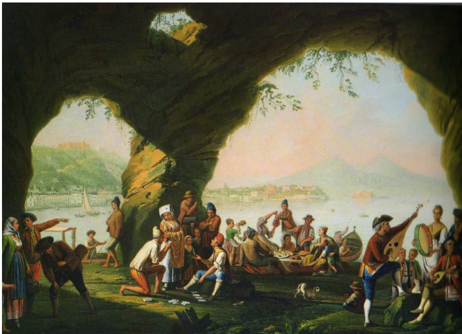
Figure 3.1. Pietro Fabris (active in Naples 1756–1792), Scena di vita popolare in una grotta a Mergellina (1756). Collection: London, Trafalgar Galleries. 479