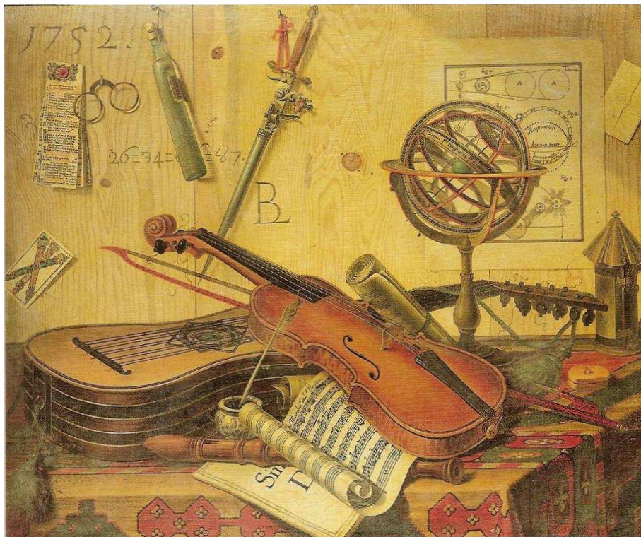
Figure 3.9. Sebastiano Lazzari (2 nd half 18th C.), Trompe l'oeil con strumenti musicali , Verona, 1752. Collection: Auction Sale Finarte, Milano 14 November 1990. Current location unknown. 621

sopranino in Leipzig (Gra.SPI.01), with more simple turning work, as well as the Grassi alto of Rome (Gra.ALT.01). The overall design is also not far from that of the Perosa soprano of Vienna (Per.SPO.01). Traces of all of these instruments are also found in a trompe l'oeil by Sebastiano Lazzari, dated 1752 (Figure 3.9). The shape of the head joint on the recorder depicted by Lazzari is very similar to that of the recorder depicted by Munari in both Figure 3.7 and 3.8, though without the ivory mounts. Lazzari was active in the Veneto until 1766, 620 so a correspondence with 'Venetian' instruments such as those of Anciuti, Castel and Perosa is not at all strange.