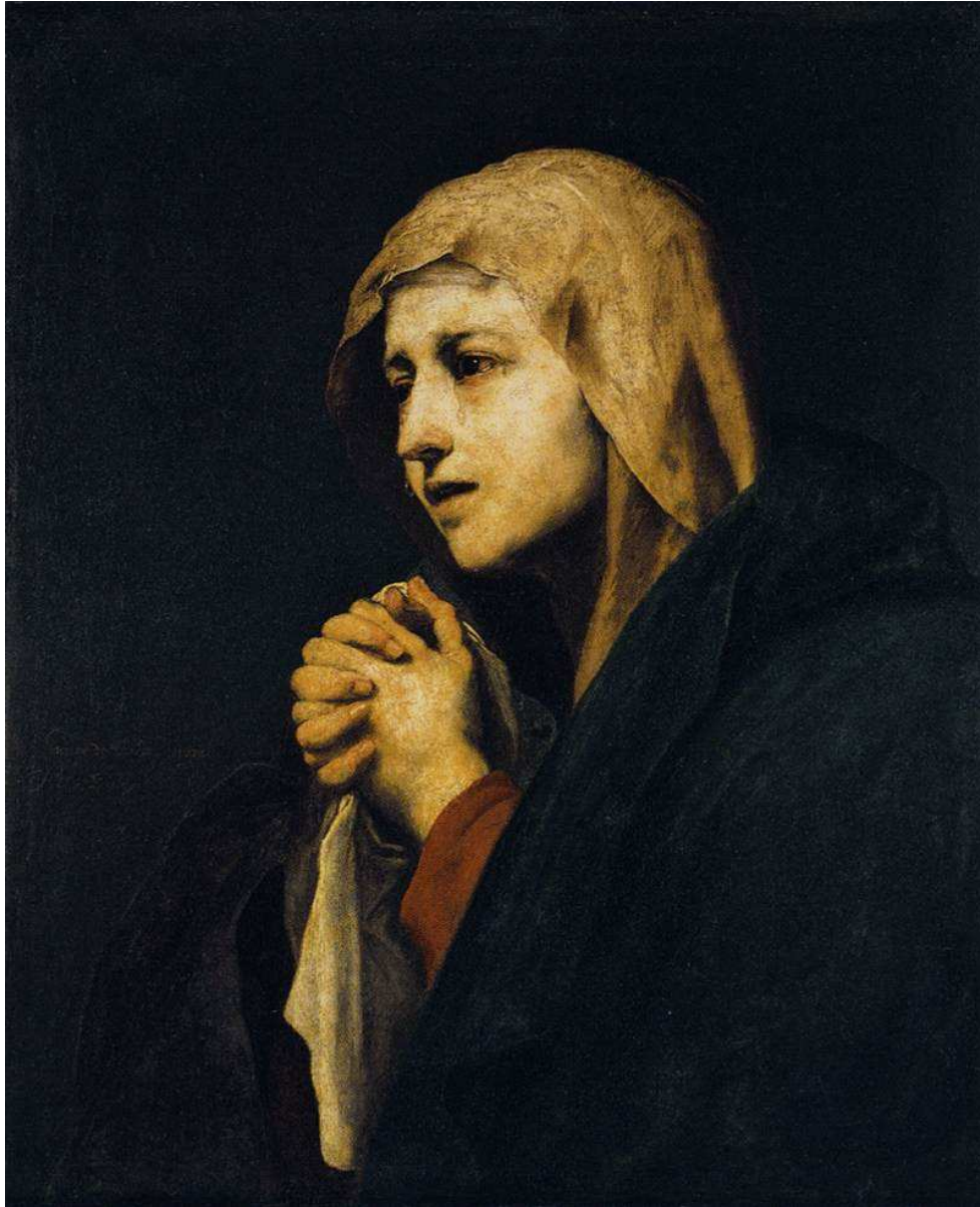
Figure 3.4. Jusepe de Ribera detto lo Spagnoletto (1591–1652), Mater dolorosa (1638). Collection: Museumslandschaft Hessen Kassel, Kassel, Germany. 498

Such a mixture of simple and complex, rich and poor, sacred and secular comes into play in the actual fabrication of artworks in Naples. As art historian Sabina de Cavi writes, the “synaesthetic and synergetic interplay of the high and popular arts in southern Italian baroque architecture and its impact on society” is paramount to the observation and understanding of Neapolitan Baroque art: 499