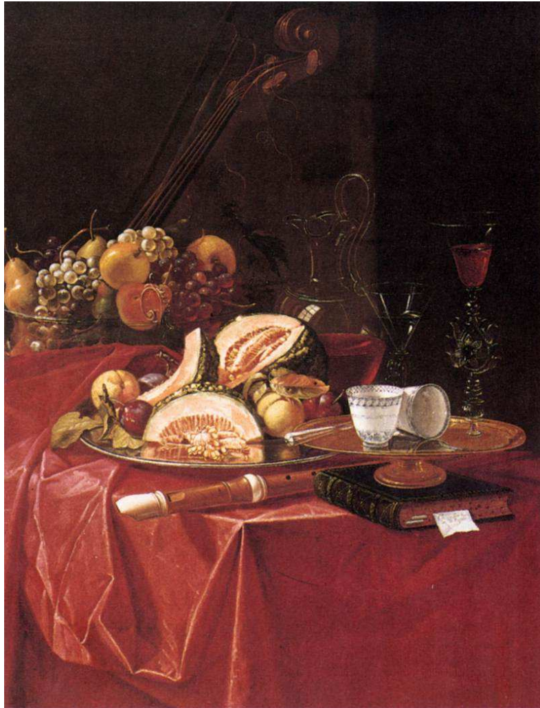
Figure 3.8. Cristoforo Munari (1667–1720), Still life . Private collection. 619