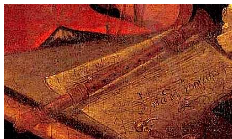
Detail of Figure 3.13 (colors tempered to bring out the recorder).