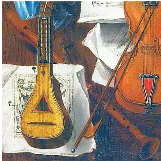
Detail of Figure 3.12 (colors tempered to bring out the recorder).