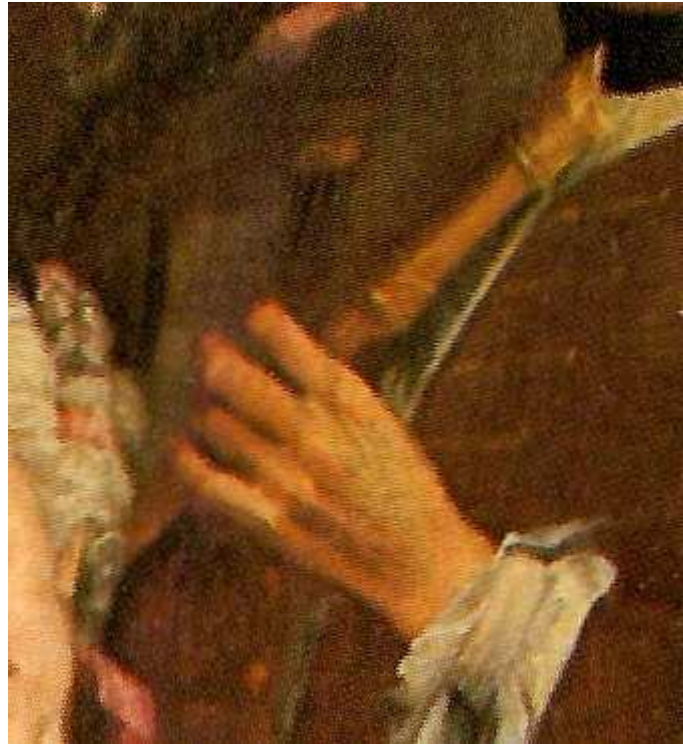
Details of Figure 3.14.

Unlike the still lifes by Munari and Lazzari, extracting any particular design features of the recorder depicted in Figures 3.13 and 3.14 is impossible. Both are clearly Baroque altos, and seem to be made in boxwood. The clothes of the women and men portrayed in Figures 3.13 and 3.14 denote a certain air of aristocracy, since they appear to be made of noble and colorful fabrics, beautifully draped. This confirms one of the most important settings for the recorder in the eighteenth century, all over Europe: that of the enjoyment of music in a private sphere.