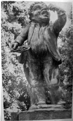
Figure 32: Domenico Pieratti, on a design by Baccio del Bianco, Villano che mangia , 1643-51, garden Palazzo di San Clemente, Florence. Reproduced in: Riccardo Spinelli, 'Indagini sulle decorazioni secentesche del Casino Guadagni' di San Clemente' a Firenze', Quaderni di Palazzo Te (1996), pp. 36-65.

Reproduced in: Riccardo Spinelli, 'Indagini sulle decorazioni secentesche del Casino Guadagni' di San Clemente' a Firenze', Quaderni di Palazzo Te (1996), pp. 36-65.