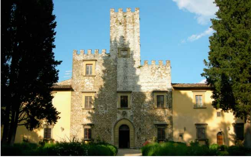
Figure 37: Castello di Montauto.