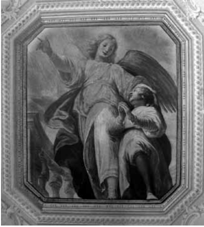
Figure 33: Matteo Rosselli, L'angelo custode , 1638, Palazzo di San Clemente, Florence. Reproduced in: Riccardo Spinelli, 'Indagini sulle decorazioni secentesche del Casino Guadagni di San Clemente' a Firenze', Quaderni di Palazzo Te (1996), pp. 36-65.