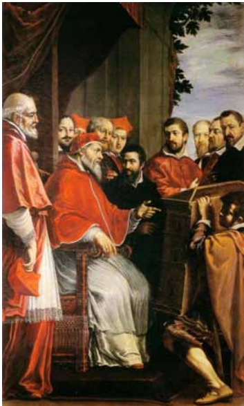
Figure 11: Fabrizio Boschi, Michelangelo presents the model of the Palazzo di Strada Giulia to Pope Julius III in 1522, in the presence of cardinals , 1617, Casa Buonarroti, Florence.