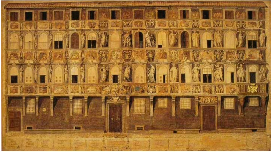
Figure 27: Palazzo dell'Antella. Plan for the façade by Giovanni da San Giovanni, 1619-20, Florence Uffizi gallery, Department of Prints and Drawings, 1088. Reproduced in: Elena Pecchioli, The painted Facades of Florence. From the fifteenth to the twentieth century , 2005, p. 70/71.