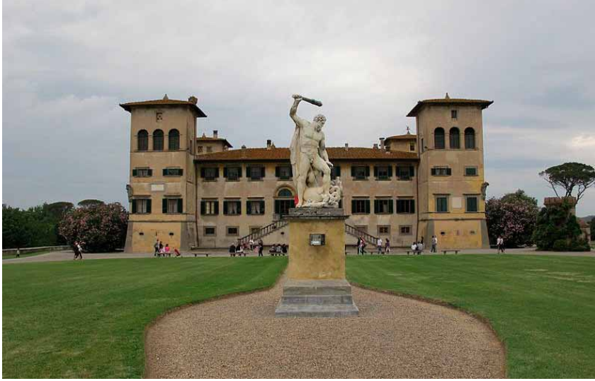
Figure 5: Villa Niccolini di Camugliano with the sculpture group Ercole che uccide l'Idra (Hercules slays the Hydra) by Giovanni Bandini (1573-78).