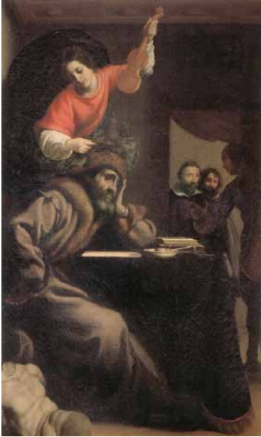
Figure 13: Zanobi Rosi, Michelangelo and Poetry , 1622, Casa Buonarroti, Florence. Reproduced in: Janie Cole, A muse of music in early baroque Florence. The poetry of Michelangelo Buonarroti il Giovane , Florence 2007.