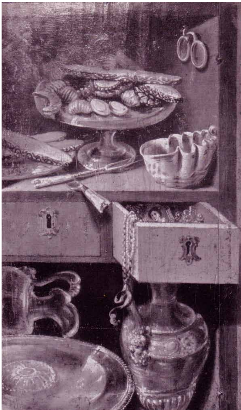
Figure 19: Baccio del Bianco, Natura morta , 1627, Casa Buonarroti, Florence.