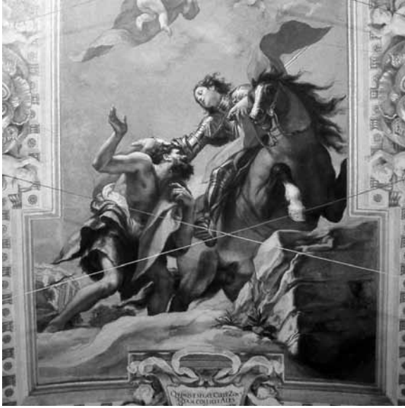
Figure 31: Il Volterrano, San Martino dona il mantello al povero (detail), 1637-42, fresco Palazzo di San Clemente, Florence.

Reproduced in: Riccardo Spinelli, 'Indagini sulle decorazioni secentesche del Casino Guadagni' di San Clemente' a Firenze', Quaderni di Palazzo Te (1996), pp. 36-65.