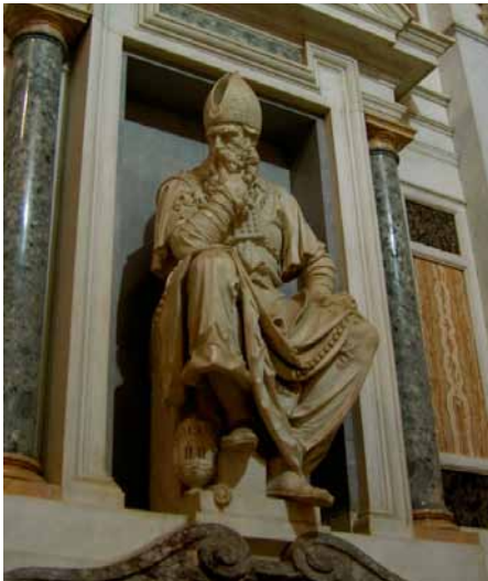
Figure 2: Pietro Francavilla, statue of Aaron , 1592, Cappella Niccolini, Santa Croce Florence.