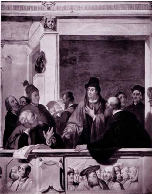
Figure 25: Domenico Pugliani, The philosophers , 1636, Casa Buonarroti, Florence.