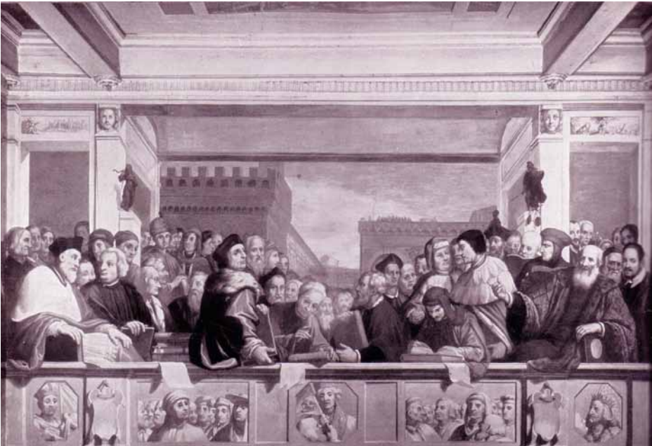
18: Matteo Rosselli, The jurists, the historians, the orators and the chroniclers , 1636, Casa Buonarroti, Florence.