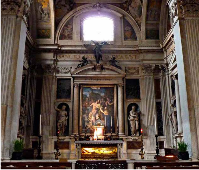
Figure 3: Cappella Salviati , San Marco Florence (Giambologna, 1589).