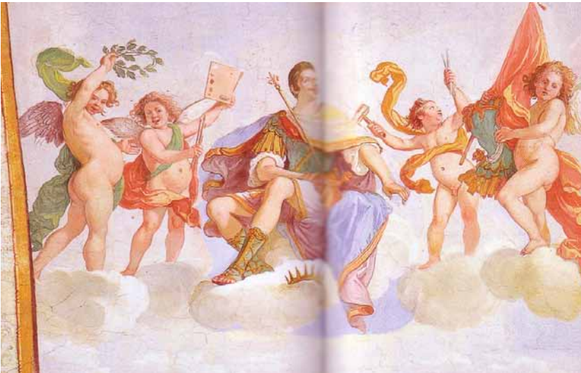
Figure 14: Anastagio Fontebuoni, Cosimo II surrounded by personifications of the Arts , 1621-23, Casino Mediceo, Florence.