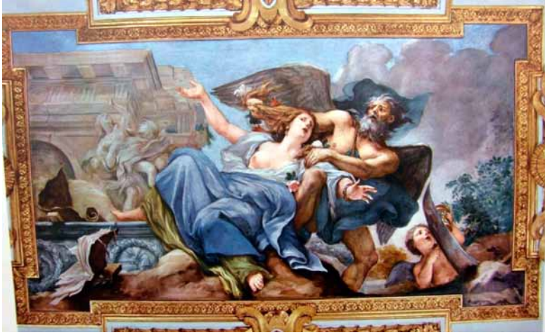
Figure 39: Il Volterrano, La bellezza lacerata dal tempo , 1651-52. Palazzo Niccolini, Florence. Reproduced in: Restauro del palazzo Montauti Niccolini sede del provveditorato alle opere pubbliche per la Toscana in Firenze , Florence 1959.