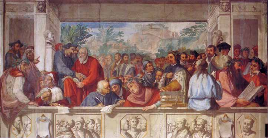
Figure 17: Cecco Bravo, The poets and the writers , 1636, Casa Buonarroti, Florence.