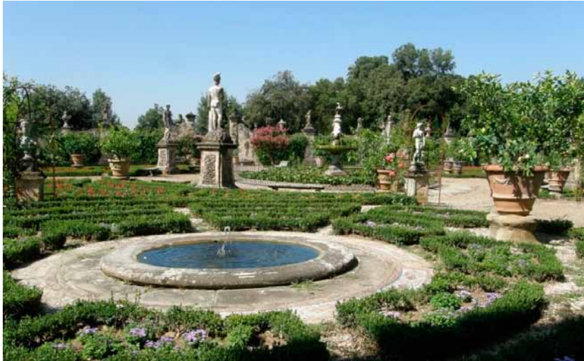
Figure 36: Garden Villa Guicciardini Corsi Salviati. Photograph by the author (July 2010).