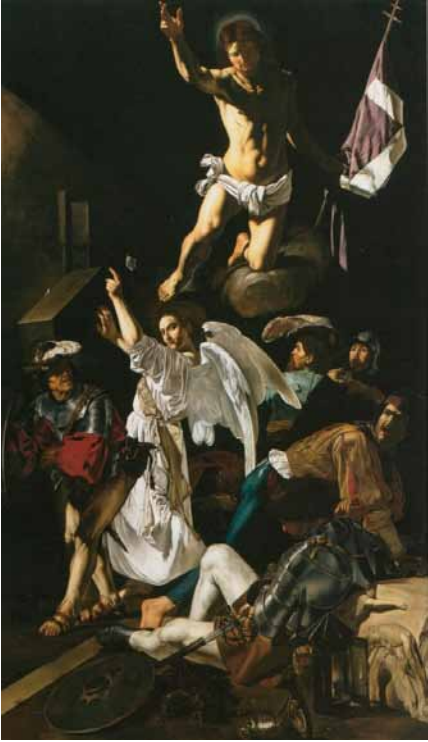
Figure 8: Cecco del Caravaggio, Resurrection , 1619-20, Art Institute Chicago. Reproduced in: Gianni Papi (ed.), Caravaggio e Caravaggeschi a Firenze , Livorno 2010, p. 151.