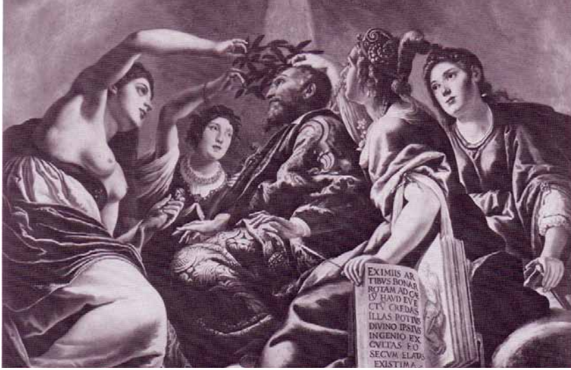
Figure 15: Sigismondo Coccapani, Michelangelo crowned by the Four Arts , 1619, Casa Buonarroti, Florence.