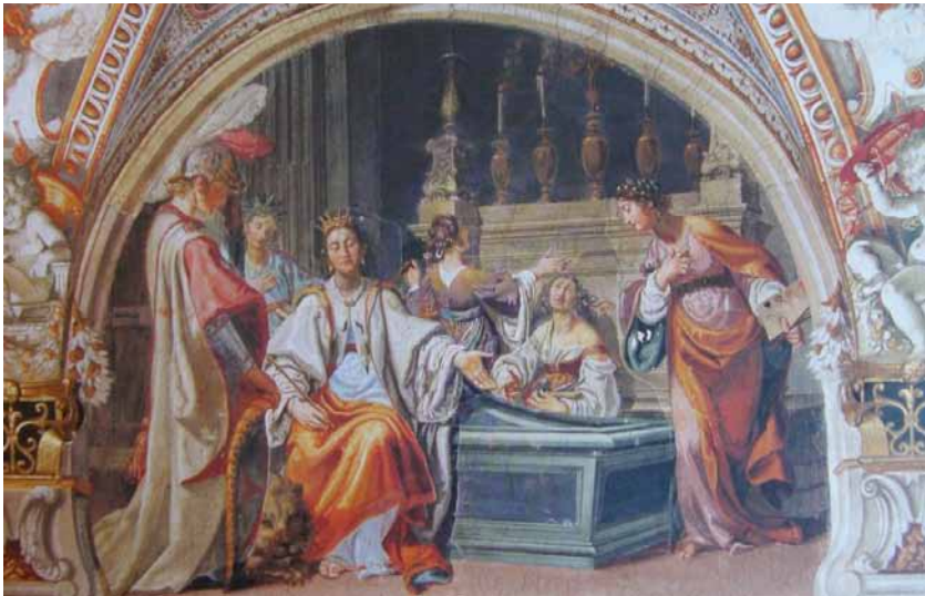
Figure 16: Bartolomeo Salvestrini, La Toscana e le arti piangono la morte di Cosimo II ( Tuscany and the Arts lament the death of Cosimo II ), 1621-23, Casino Mediceo Florence.