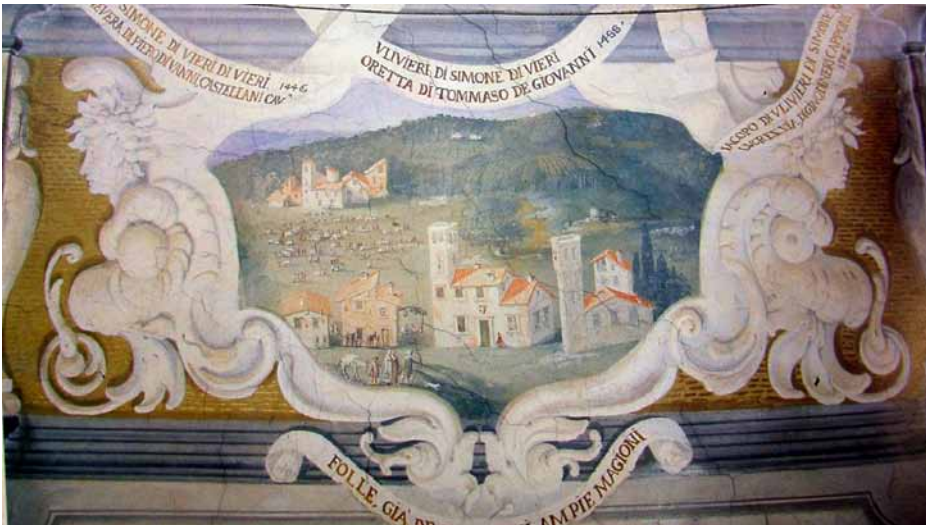
Figure 30: Baccio del Bianco, il feudo di Folle , 1637-42, Palazzo di San Clemente, Florence. Reproduced in: Riccardo Spinelli, 'Indagini sulle decorazioni secentesche del Casino Guadagni di San Clemente' a Firenze', Quaderni di Palazzo Te (1996), pp. 36-65.