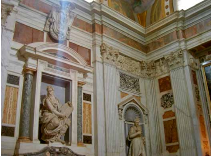
Figure 1: Cappella Niccolini , Santa Croce Florence, on the left the statue of Moses by Pietro Francavilla (1592). (Photograph by the author, September 2008)