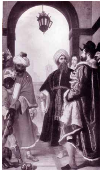
Figure 12: Giovanni Biliverti, The sultan of Turkey invites Michelangelo to build a bridge over the river Bosphorus in Constantinople , 1620, Casa Buonarroti, Florence.