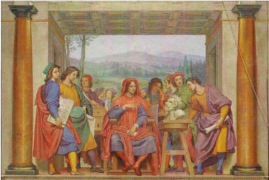
Figure 23: Ottavio Vannini, Lorenzo the Medici surrounded by artists , 1638-42, Salone degli Argenti, Palazzo Pitti, Florence.