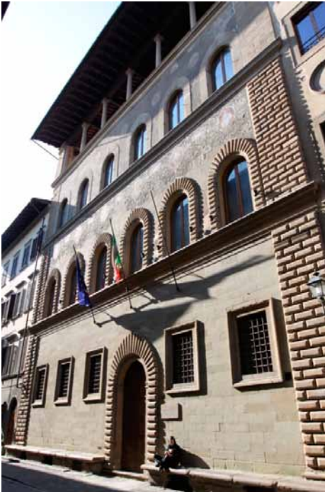
Figure 4: Palazzo Niccolini, Via de' Servi 15.