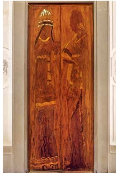
Figures 20 and 21: Pietro da Cortona, intarsia-decoration at the wooden doors in the Casa Buonarroti, Florence