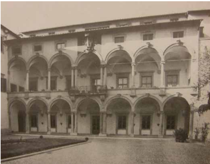
Figure 38: Palazzo Niccolini with the second loggia commissioned by Filippo Niccolini. Reproduced in: Restauro del palazzo Montauti Niccolini sede del provveditorato alle opere pubbliche per la Toscana in Firenze , Florence 1959.