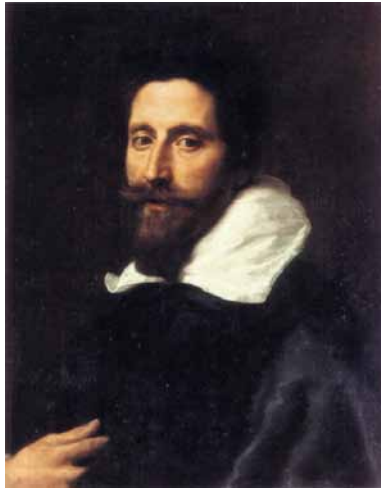
Figure 10: Cristofano Allori, portrait of Michelangelo Buonarroti the Younger , 1610. Reproduced in: Janie Cole, A muse of music in early baroque Florence. The poetry of Michelangelo Buonarroti il Giovane , Florence 2007.