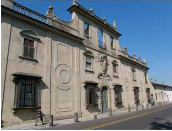
Figure 34: garden façade Villa Guicciardini Corsi Salviati.