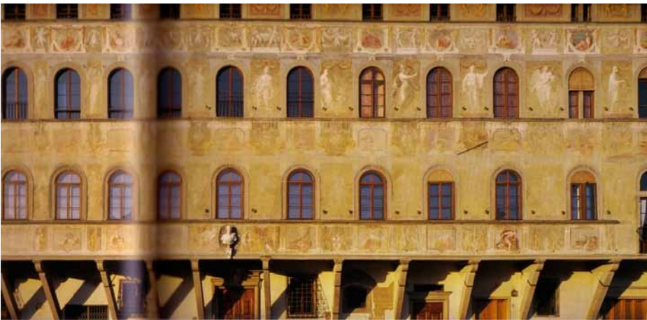
Figure 26: Palazzo dell'Antella , piazza Santa Croce, Florence Reproduced in: Elena Pecchioli, The painted Facades of Florence. From the fifteenth to the twentieth century , 2005, p. 70/71.