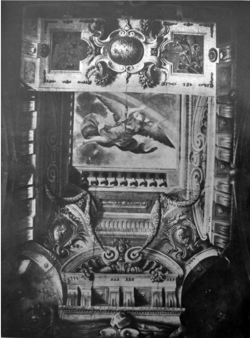
Figure 41: Angelo Michele Colonna, ceiling of the Galleria, 1663, Palazzo Niccolini Florence. Reproduced in: Restauro del palazzo Montauti Niccolini sede del provveditorato alle opere pubbliche per la Toscana in Firenze , Florence 1959.