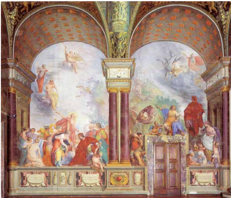
Figure 22: Cecco Bravo, Lorenzo receives Apollo and the Muses (on the left) and Lorenzo brings peace (on the right), 1638-42, Salone degli Argenti, Palazzo Pitti, Florence.