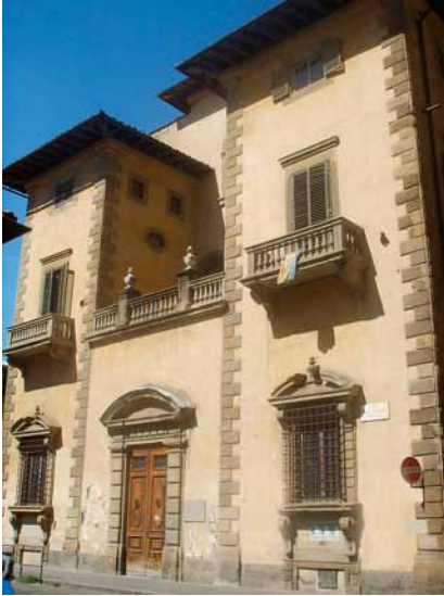
Figure 29: Palazzo di San Clemente (Casino Guadagni), Via Micheli 2 (corner Via Capponi)