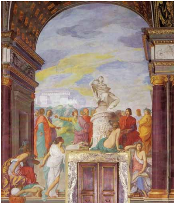
Figure 24: Francesco Furini, Lorenzo the Medici between poets and philosophers , 1638-42, Salone degli Argenti, Palazzo Pitti, Florence