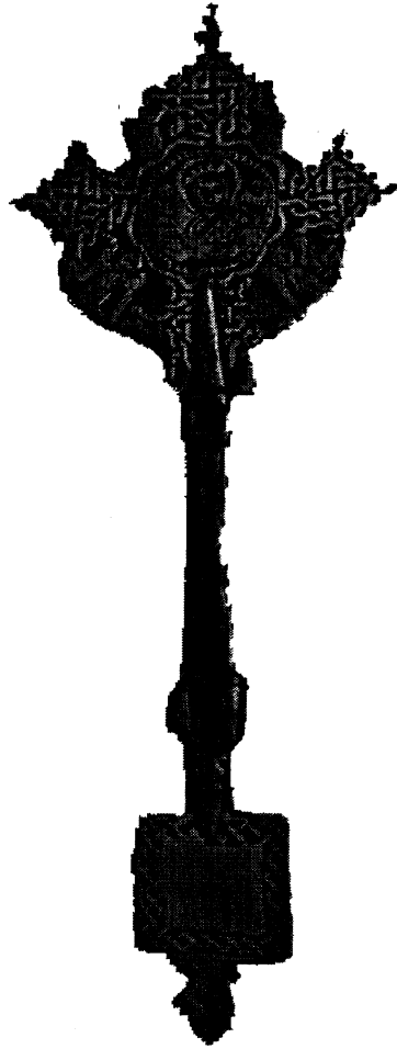
Ethiopian silver hand cross, 19 th century