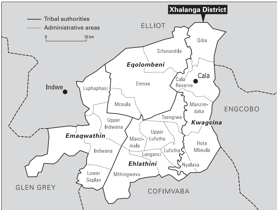
Map 2 Map of the Xhalanga District showing the four tribal authorities