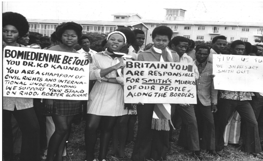
Photo 5 Students of Evelyn Hone College in Lusaka protesting against minority rule and the government of Ian Smith in Rhodesia

My work here, which draws heavily on material from Zambian and American archives not utilized previously by other scholars, brings new evidence to light. Furthermore, my essay includes crucial examples from the entire span of the First Republic, whereas Anglin only covered 1965-66. More importantly,