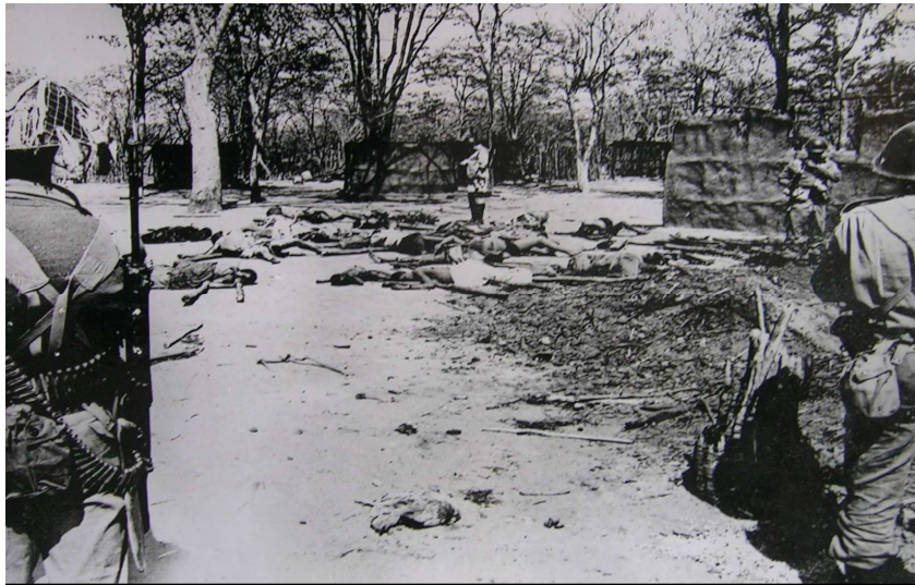
Photo 4 Zambian soldiers survey the dead followers of Alice Lenshina, Chinsali District, 1964.