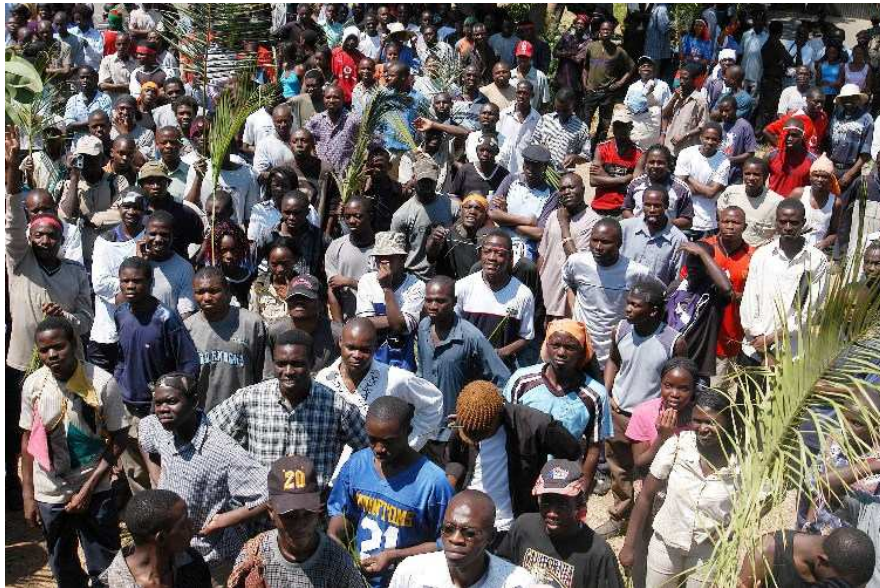
Photo 21 Oasis protestors at the University of Zambia during the final years of President Frederick Chiluba's rule.

corporate boardrooms on distant continents. Her state budget, and the policy instruments by which government claims to address the banes of poverty, unemployment, ill-health and illiteracy, are strictly controlled by transnational debt-masters in Washington. Even Zambia's major religious bodies – and their concomitant items of doctrine and faith – are beholden to unassailable episcopal hierarchies the apices of which reside in Europe and North America. On the whole, Zambians have virtually no say at all on vital questions of life and death – like the price of copper and fossil fuels, the right of Christian clergy to exorcise demons or the affordability of anti-retroviral drugs.