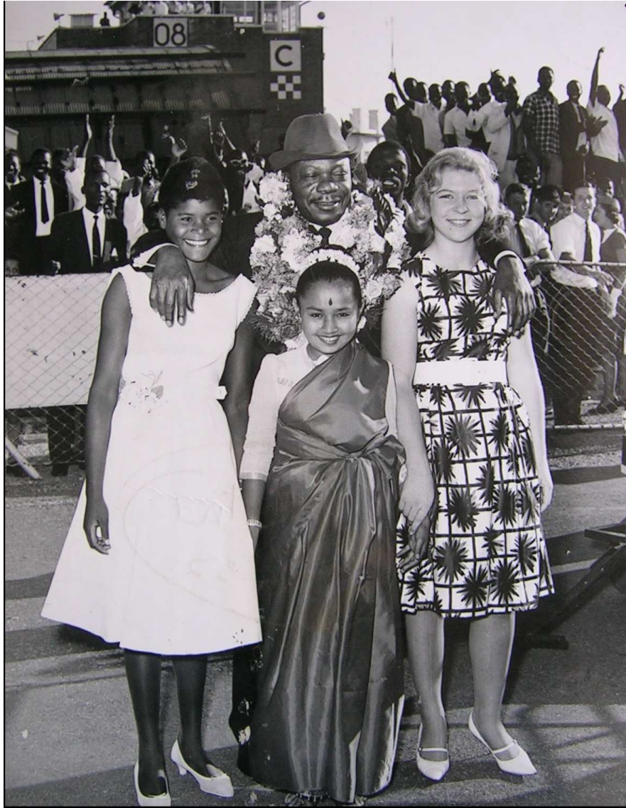
Photo 1 Harry Nkumbula emphasizing his non-racial credentials, Lusaka city airport, prior to independence