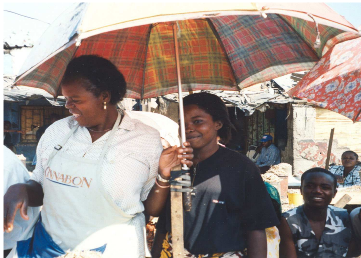
Photo 19 Crowding at the old Soweto Market