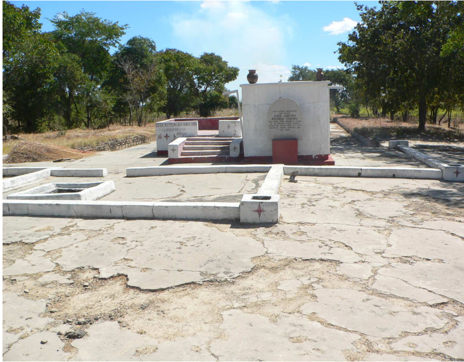
Photo 3 The remnants of Lenshina's Church at Zion, near Kasomo Village, Chinsali. Kenneth Kaunda ordered the destruction of the Church in 1970. Alice Lenshina is buried at the former altar of the church. Her gravestone repeats the words of the original foundation stone and reads: 'Alice Lenshina Mulenga Lubusha. She was born in 1924. She died for the first time on 25 October 1953. On the 26 th she met with Jesus and was given the work. Father builds on the rock. On 7/12/1978 she received rest and returned to God, our father'.

The established and conventional history of the Lumpa–UNIP conflict views it as the culmination of a Lumpa rebellion against authority that began almost a decade earlier. At least since 1991, however, a new but still marginal version of events has surfaced. This version is based more on reconstructed oral testimony than on official documentation. It has emerged from the remnants of the banned Lumpa Church, reconstituted as the Jerusalem Church after years of exile in the Democratic Republic of the Congo (DRC). The new interpretation has joined longstanding opposition to Kenneth Kaunda and UNIP in the Chibemba-speaking heartland of the Northern Province districts of Chinsali and Kasama. In essence, the claim is that there was never an uprising against authority but a massacre by authority. Kenneth Kaunda provoked a war between local UNIP