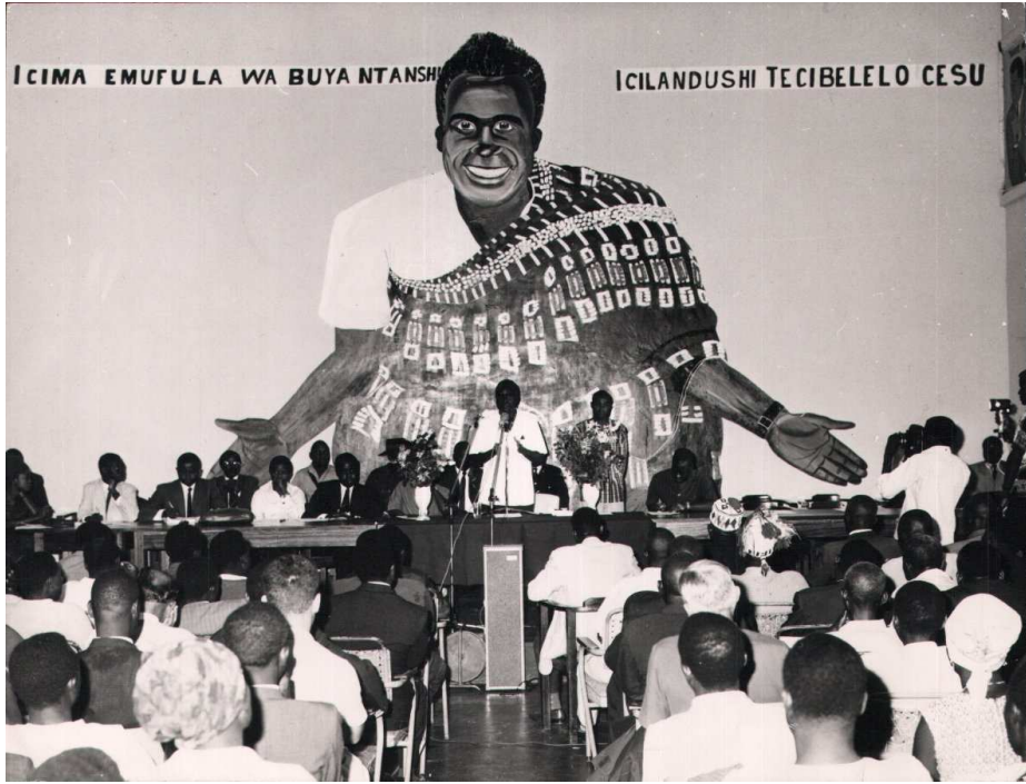
Photo 10 Zambian President Kenneth Kaunda addressing the party faithful