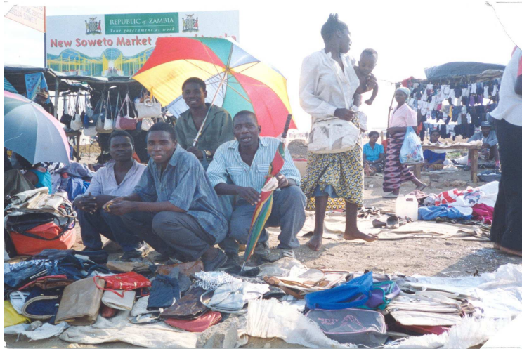
Photo 12 Secondhand vendors on the ground of the construction site of the new market at Soweto.