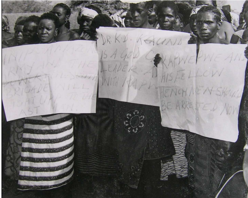
Photo 7 UNIP supporters protesting against the formation of the UPP. The placards read: 'UNIP Amozone army and the powerful youth brigade will fight UPP to the last man'; 'Dr. K.D. Kaunda is a God given leader away with Kapwepwe'; 'Kapwepwe and his fellow henchmen should be arrested now'.

The chapter also explores the changing political perspectives of Kapwepwe, primarily through interviews with many of his leading supporters in the UPP. Perceived in the 1960s as a militant anti-western and pro-Chinese nationalist, Kapwepwe's leadership of the UPP rested in practice on a political ambiguity that generated support from conservative small businessmen, socialist students, and peasants in Northern Province, for whom his attraction was primarily as an ethnic Bemba aristocrat. In the late 1970s, he appears not only to have accepted the ideas of right-wing business-oriented critics of UNIP's state-led nationalism, but also the initiation of a project to remove Zambian President Kenneth Kaunda from power that culminated, after Kapwepwe's death, in the coup plot of 1980. The chapter reveals new evidence regarding the political ideas and practical actions behind the coup attempt, based on interviews with some of the participants.