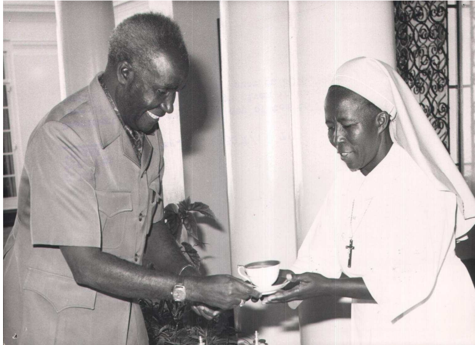
Photo 8 President Kenneth Kaunda, during the later years of his rule, serving tea to a Catholic nun.