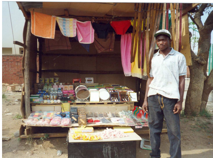
Photo 11 Vendor at his tuntemba on Independence Avenue before it was demolished in 1999.

The informal economy as a policy concern: Neither the one-party state nor the state in the neo-liberal era has been keen on the informal economy. The general approach to urban growth and along with it, the informal economy, has been neglect if not outright hostility. Intermittently, mostly through external intervention, specific urban issues have been brought into focus. But only recently with World Bank endorsement of PRSP are pro-poor policies called on, including support for micro-enterprises and credit, in a way that recognizes informality as an asset rather than a problem that ought to go away.