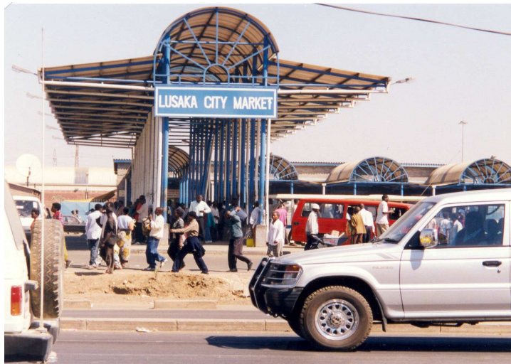
Photo 13 Completed market at Soweto called the Lusaka City Market.