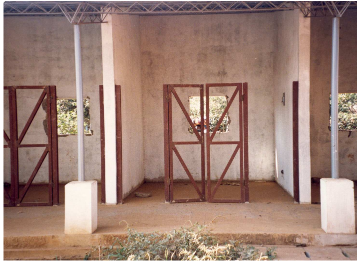
Photo 16 Unfinished market structures at Chilenje