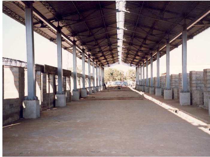
Photo 18 Unfinished market structures at Libala