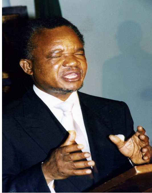
Photo 9 Zambian President Frederick Chiluba, self-declared exponent of the Christian Nation.