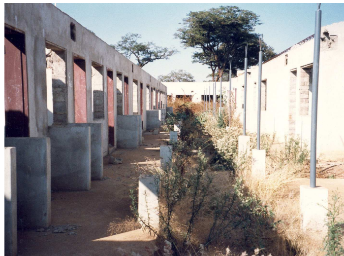
Photo 17 Unfinished market structures at Chilenje