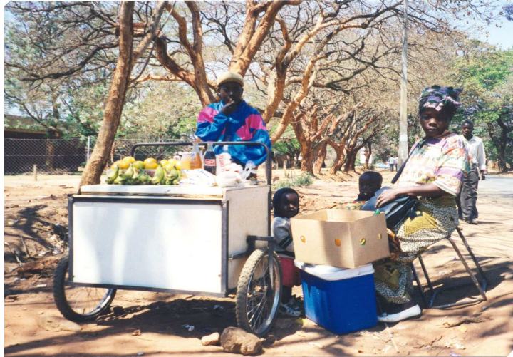
Photo 14 Fruit vendor turned mobile after being chased away from selling at the bus station and taxi rank in front of the University Teaching Hospital in 1999.