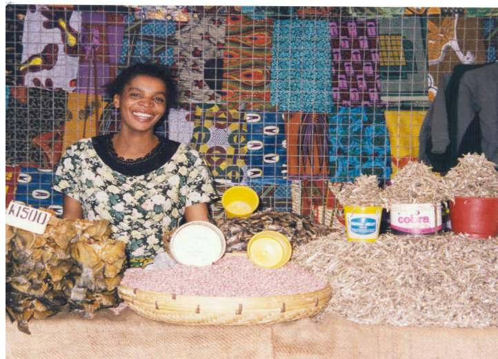
Photo 15 Dried fish vendor inside Lusaka's new City market. Printed cloth at nearby stall in the background.