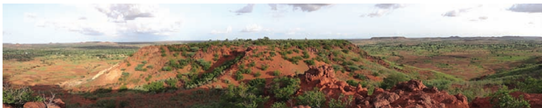
Figure 3. Location of sighting, Tankougounadié Department, Burkina Faso, 20 August 2011 (Michiel van den Bergh) Le site de l'observation, Département de Tankougounadié, Burkina Faso, 20 août 2011 (Michiel van den Bergh)

observations in, e.g., Nigeria and The Gambia suggest some winter dispersal (Collar 2005), and the species has recently been reported in southern Turkey in autumn (Cofta et al. 2005). Furthermore, Keith et al. (1992) list vagrant records from Syria and Kuwait, and indicate that the species is possibly only a summer visitor to parts of Egypt. According to Cramp (1988) some dispersal can be expected in view of its propensity for arid habitats.