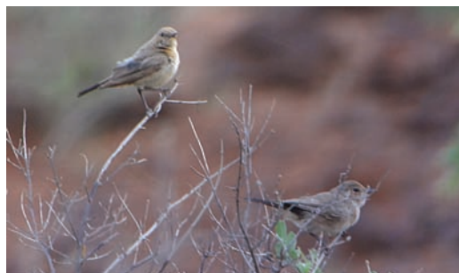
Figures 1–2. Blackstarts / Traquets à queue noire Cercomela melanura , Tankougounadié Department, Burkina Faso, 20 August 2011 (Michiel van den Bergh)