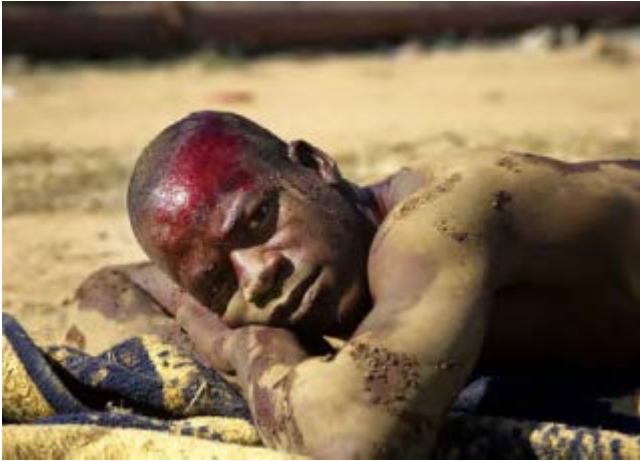
Figure 14. Unidentified victim by Nadine Hutton.