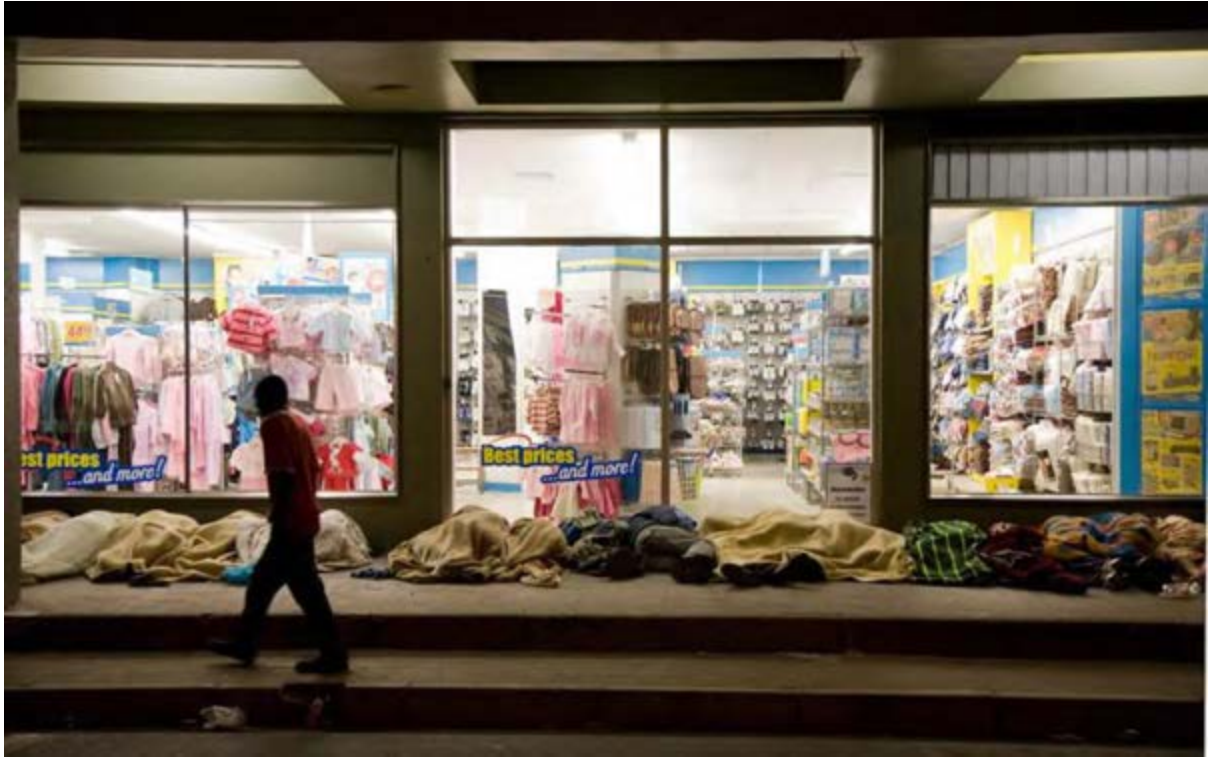
Figure 19. Displaced migrants.