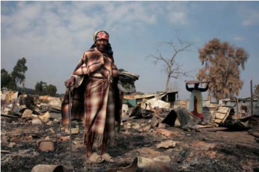
Figure 15. Identified displaced baSotho women by Nadine Hutton.