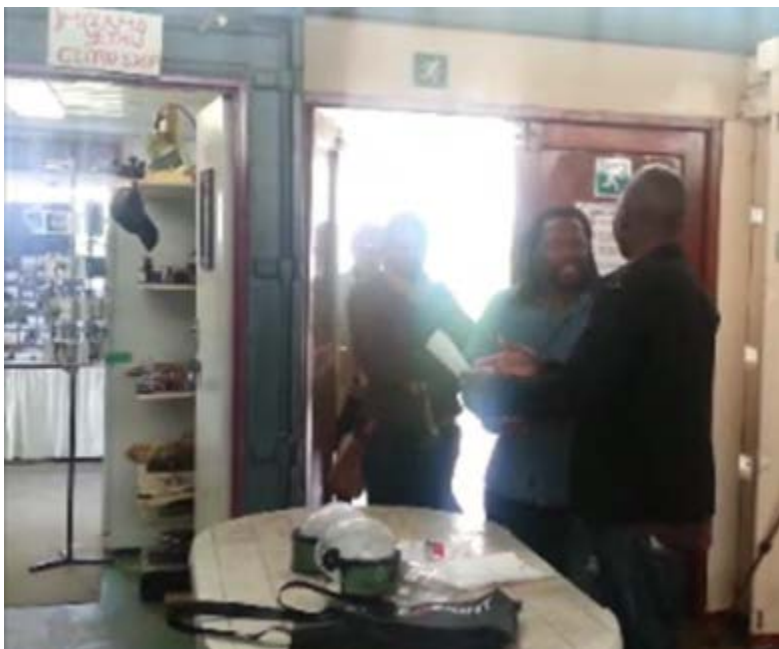
Figure 20. Audiences going through a 'border checkpoint' in Asylum:Section 22.