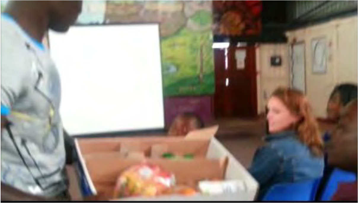
Figure21. Scene from Asylum:Section 22