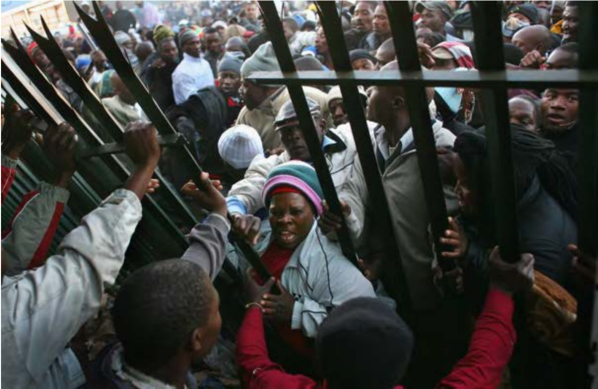
Figure 17. Displaced migrants looking for sanctuary.