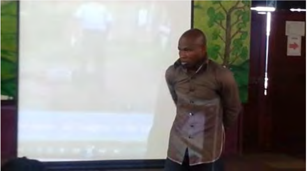
Figure 22. Performer enacting the projected multimedia footage of migrant arrest and police brutality.