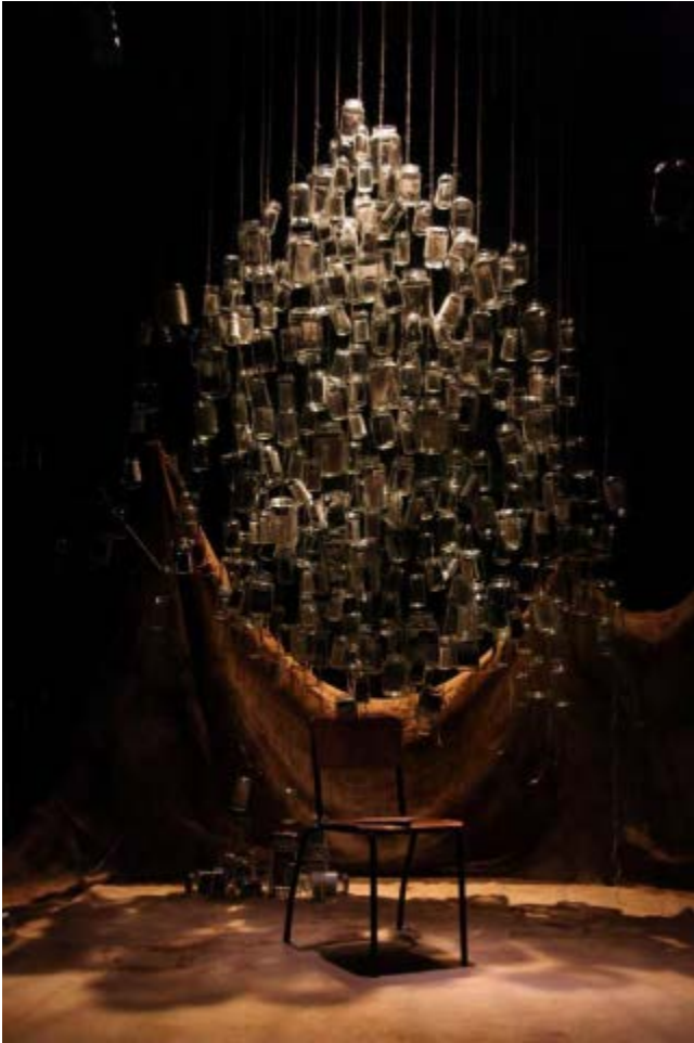
Figure 12 a and b Set design from The Line .