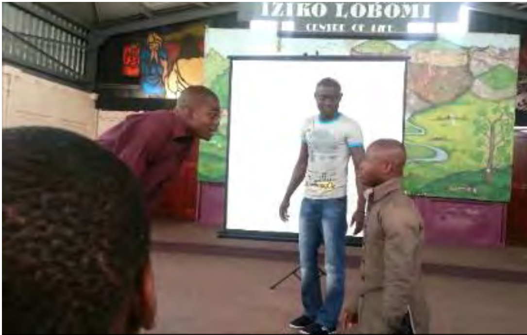
Figure 23. a and b. Migrant being interrogated by detained criminals in police detention.