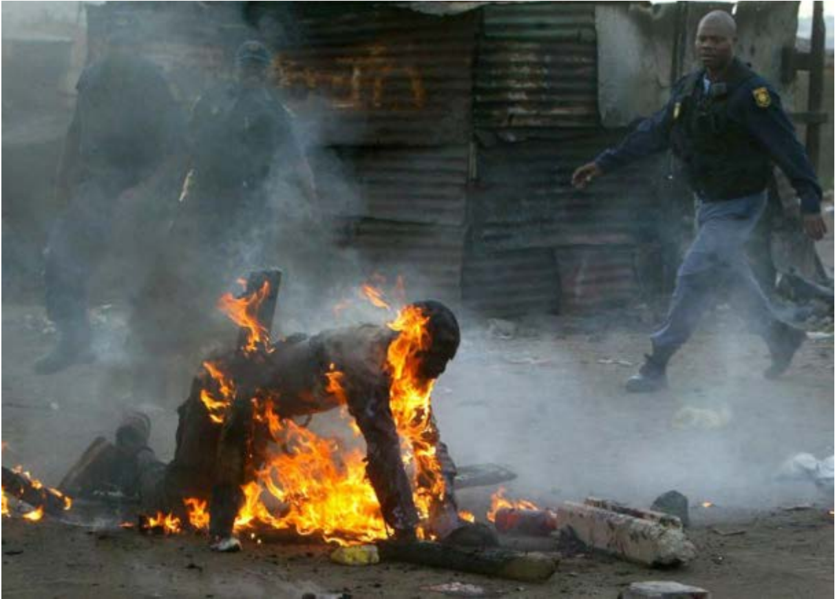
Figure 16. Ernesto Nhamuave.