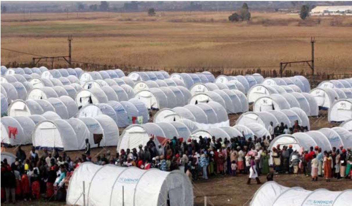
Figure 18. Make shift camps for displaced migrants.