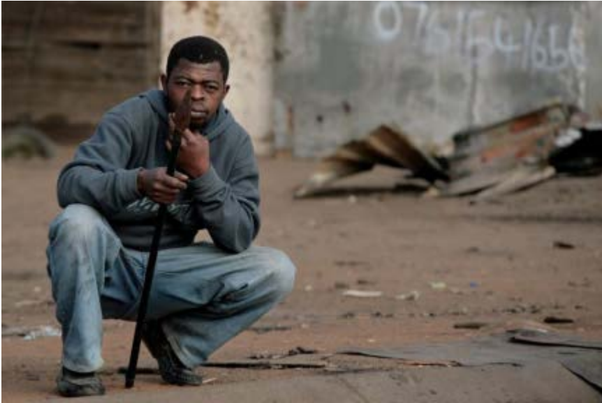
Figure 13. Unidentified perpetrators.