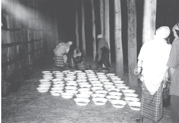
Fig. 4: Preparing the food after the Ramad'an fasting day, Ṭəru-Şina, Wällo, 2004

voluntarily taking the assigned tasks. The entire compound, several hectares large, is kept scrupulously clean. People, including all guests, cannot walk inside the settlement with their shoes on and leave them at the entrance (fig. 5). Spitting, shouting and scraping the throat are forbidden. People visibly enjoy the peace, quiet and serenity of the place, and all go to the mosque for service. Women and female babies or children never enter.