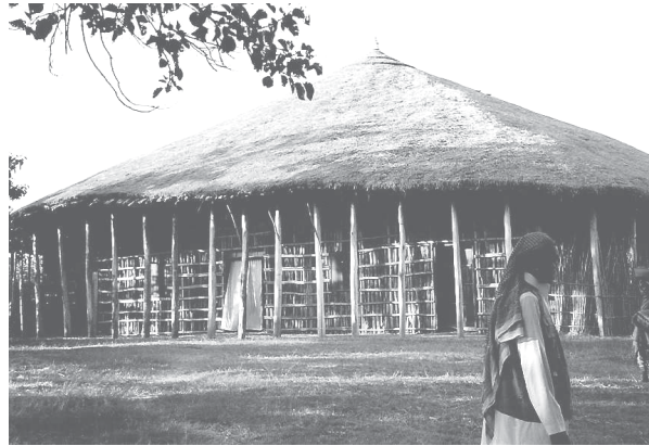
Fig. 6: The huge wooden mosque of the Muslim ‘monastery’ of Ṭəru-Şina, Wällo, 2004

The pride of Ṭəru-Şina is the big new mosque (fig. 6). This is indeed one of the biggest wooden mosques in Ethiopia, measuring some 80 by 80 m with a height of 20 m, and took years to build. The wood is hard juniper-tree wood, brought from 15–20 km distance from Mt. Rikke, a Muslim Argobba area. The architect of the mosque was Ato Muḥammad Aman, but it was built by collective effort of Ṭəru-Şina’s inhabitants and the surrounding Muslim farmers. Of all the Sufi settlements in Wällo, Ṭəru-Şina is the most like a monastery.