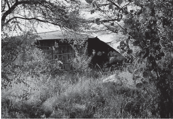
Fig. 2: Grave of the first saint of Čali, late 18 th century