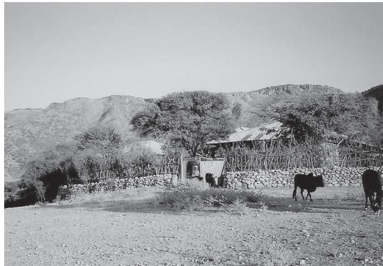
Fig. 1: The Čali fenced compound

The permanent inhabitants of Čali are the walī and his large family, religious teachers, candidate-initiates ( murīd ) for the Ẓādiriyya order, assistants, and students, varying from 12 to 28–30 years of age, several of them relatives of the walī . Daily life is marked by prayer, study and discussion of the Qurʾān and religious texts, and performance of awrād (sg. wird , the initiation litanies of the Sufi order) (see fig. 3), and by labour tasks needed for the community: building, repairing, and preparing the daily meals (the latter mainly by females in the other part of the compound). The walī and his advisors also receive guests and local people who come to the shrine for advice or conflict mediation. There is a spokesman or work leader called kaddam ,