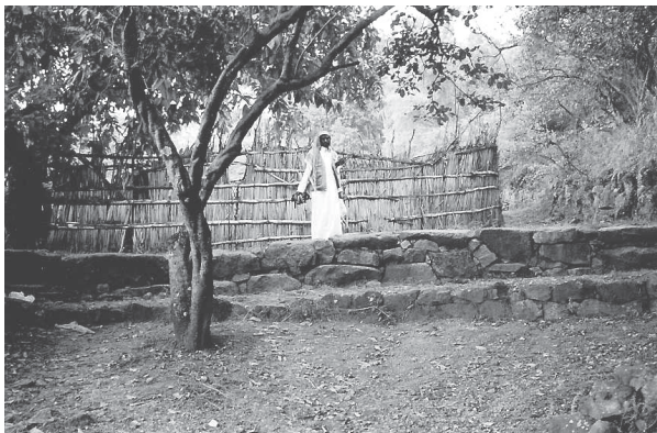
Fig. 5: The entrance of the Ṭəru-Şina settlement

voluntarily taking the assigned tasks. The entire compound, several hectares large, is kept scrupulously clean. People, including all guests, cannot walk inside the settlement with their shoes on and leave them at the entrance (fig. 5). Spitting, shouting and scraping the throat are forbidden. People visibly enjoy the peace, quiet and serenity of the place, and all go to the mosque for service. Women and female babies or children never enter.