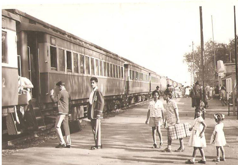
Figure 11.1 Catching the train to school, mid-1950s

brittle halwa worse for wear after 28 days of sea travel and carrying the pungent smell of naphthalene. With the trunks there was the ubiquitous bistro (bedding), comprising of a padded quilt, which doubled as a mattress, a couple of blankets and a pillow, rolled up and strapped with leather belting. 42