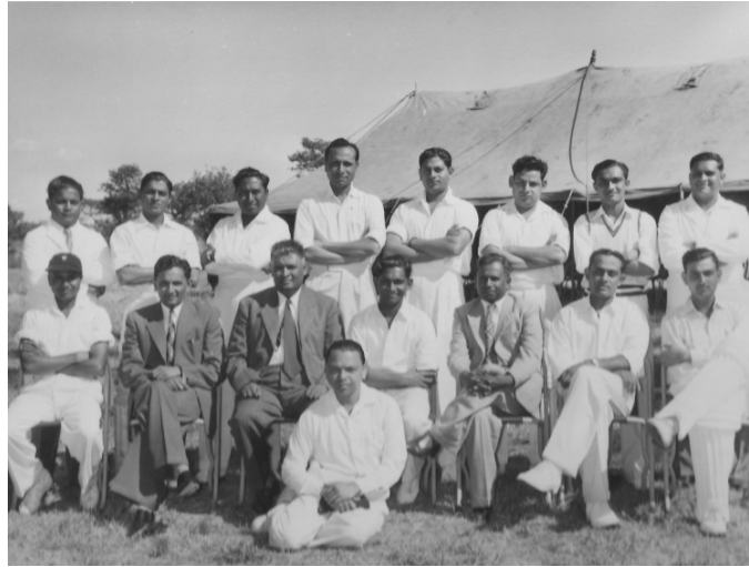
Figure 11.2 The Northern Rhodesian cricket team, 1957

With typical discretion, however, few of the Indians I spoke to referred to the financial aspect of their lives in that decade. They preferred to tell me about their successes elsewhere, such as on the sports field. Figure 11.2 shows the Northern Rhodesian Indian Cricket Team at a tournament in Bulawayo. 65 The team was drawn mainly from players in Livingstone. Matches there would take place in the main Showgrounds, which Indians were periodically permitted to use. Despite the rules, public spaces were sometimes used informally. For example, one of the Indians who was a teenager in the late 1950s, and whose family restaurant had the first Juke Box and one of the first pin-ball machines in Northern Rhodesia, recalled,