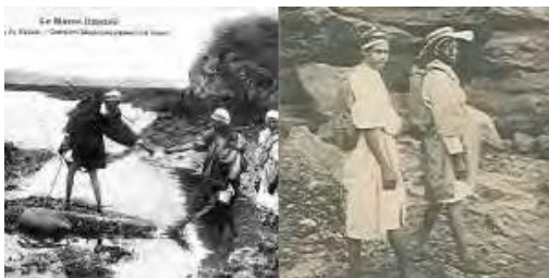
Courrier Rekkas sur Carte Postale

(In French). These are two illustrations in this publication about the postmen, called 'rekkas