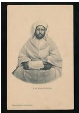
Morocco Maroc Sultan S.M.Moulay-Hafid 1912 PPC