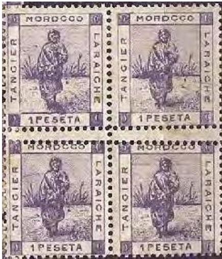
1 Peseta: http://zenius.kalnieciai.lt/africa/morocco/private/tanger-loraiche.jpg