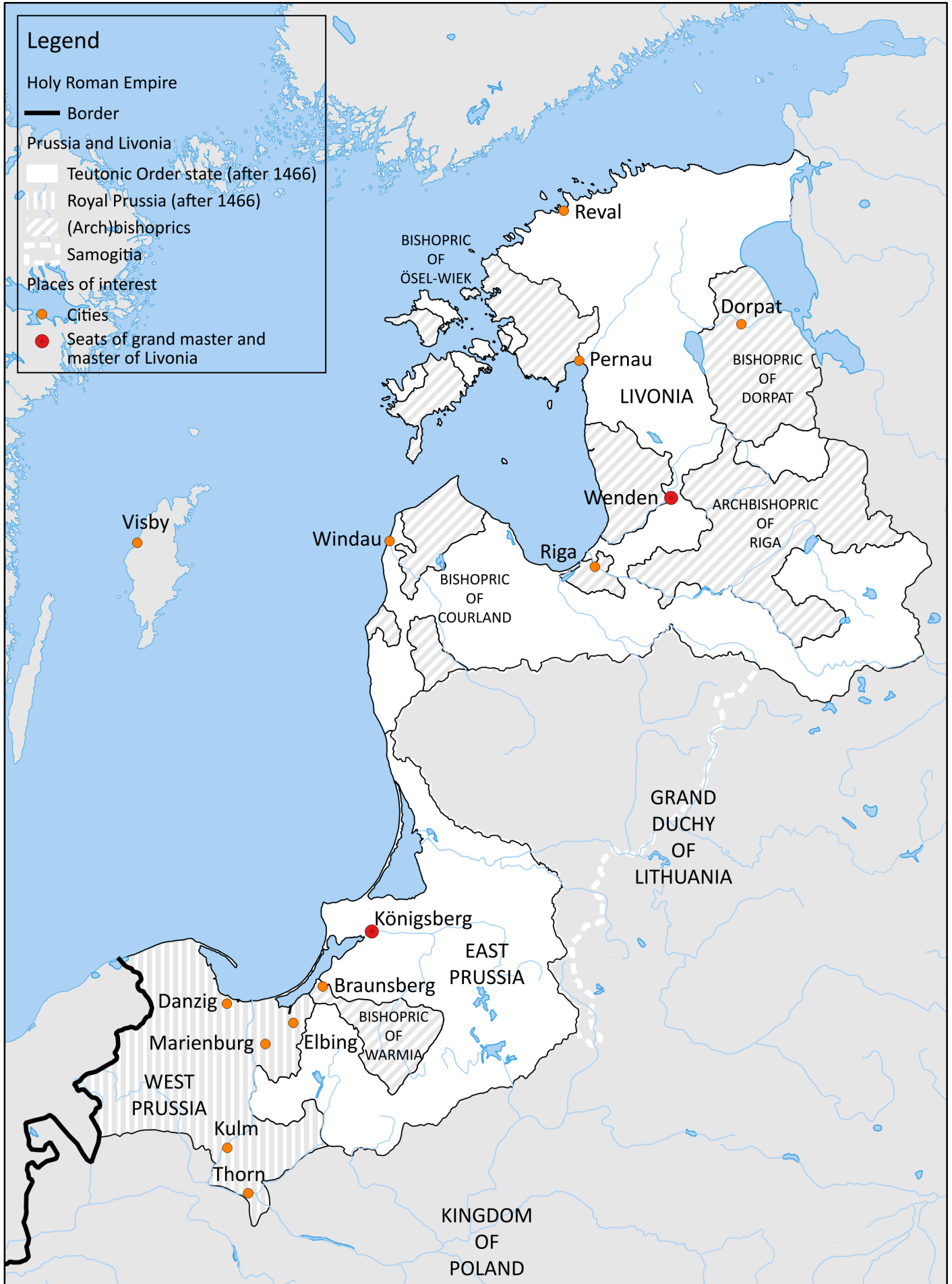
Figure 0.2 Map of Prussia and Livonia, after the Second Peace of Toruń (1466).