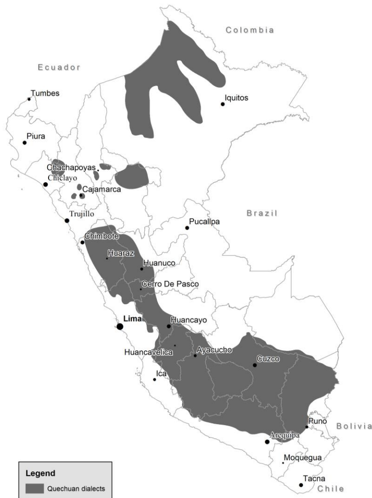
Map 1: Approximate distribution of Quechua dialects in Peru in the mid-20th century (after Adelaar/Muysken 2004: 184; map designed by Arjan Mossel)

Quechua is the indigenous language (or rather a language family) with the greatest number of speakers in the Americas. The largest group of Quechua speakers, about 3,5 million, is found in Peru, where the language had its historical origin, and where the internal variation is the greatest (see map 1 for the distribution of Quechua dialects in Peru in the mid-20 th century).