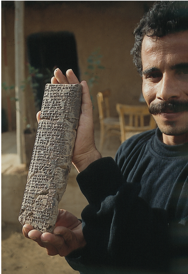
FIG. 7 TELL SABI ABYAD: A CUNEIFORM TABLET FROM THE ASSYRIAN FORTRESS, CA. 1,190 BC.

THE TEXT REFERS TO A LONG LIST OF MEN, WOMEN AND CHILDREN, PROBABLY PRISONERS OF WAR, WHO ARE ENTITLED TO FOOD RATIONS.