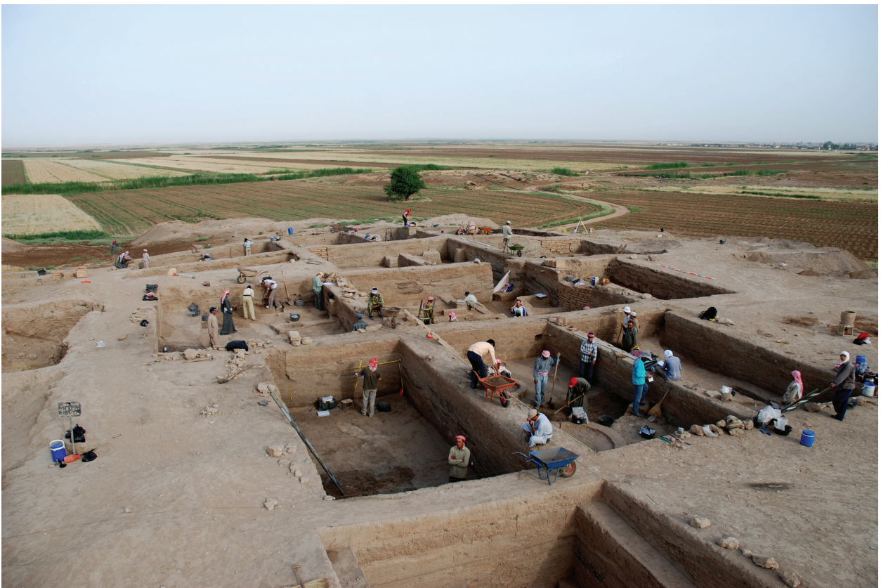
FIG. 1 TELL SABI ABYAD: THE EXCAVATIONS IN THE PREHISTORIC AREAS IN FULL SWING.

Important change in the community at Tell Sabi Abyad took place around 6200 BC, involving new types of architecture, including extensive storehouses and small circular buildings (the so-called tholoi); the further development of pottery in many complex and often decorated shapes and wares; the introduction of small transverse arrowheads and short-tanged points; the abundant occurrence of clay spindle whorls, suggestive of changes in textile manufacture; and the introduction