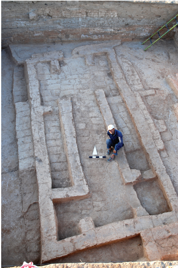
FIG. 2 TELL SABI ABYAD: SYMMETRICAL, TRIPARTITE STRUCTURE BUILT ON A PLATFORM, CA. 6900 BC.

of seals and sealings as indicators of property and the organization of controlled storage. The best information comes from the ‘Burnt Village’, destroyed by a violent fire in about 6000 BC. Rich inventories were recovered from the burnt buildings, including pottery, stone vessels, flint and obsidian implements, ground-stone tools, figurines, personal ornaments, and hundreds of clay sealings with stamp-seal impressions.