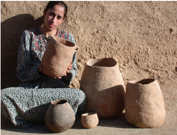
FIG. 4 TELL SABI ABYAD: LATE NEOLITHIC POTTERY, CA. 6700 BC.