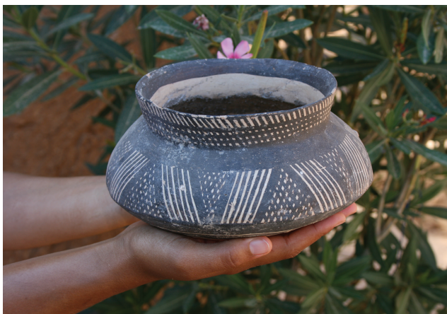
FIG. 8 TELL SABI ABYAD: AN INTRICATELY PAINTED BOWL FROM THE GRAVE OF A YOUNG WOMAN, CA. 5,800 BC.

THE TEXT REFERS TO A LONG LIST OF MEN, WOMEN AND CHILDREN, PROBABLY PRISONERS OF WAR, WHO ARE ENTITLED TO FOOD RATIONS.