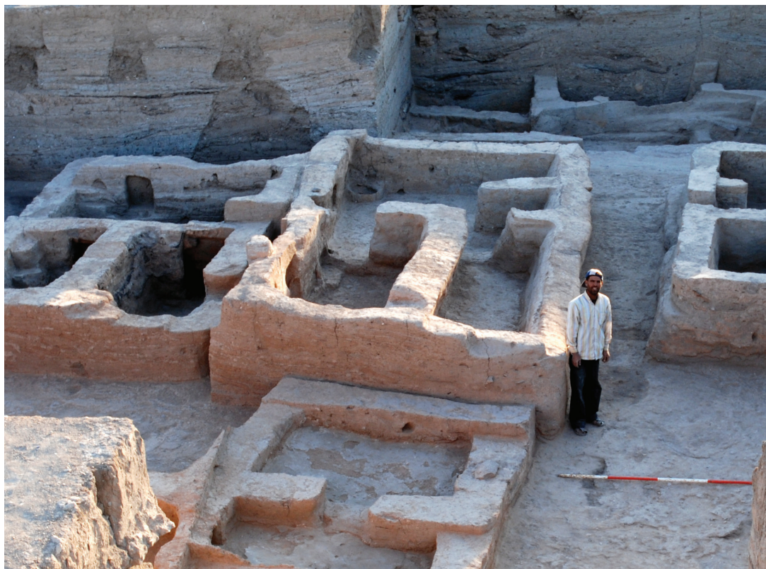
FIG. 3 TELL SABI ABYAD: PREHISTORIC MUD-BRICK ARCHITECTURE, CA. 6400 BC.

Exceptional find were the hundreds of Neolithic burials of men, women and children, radiocarbon-dated to