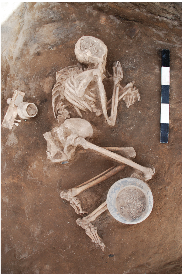
FIG. 5 TELL SABI ABYAD: AN EARLY HALAF BURIAL OF A YOUNG WOMAN WITH GRAVE GIFTS, CA. 5800 BC.

6400-5800 BC. Close examination of the stratigraphic context of each individual grave and the corresponding radiocarbon data has shown that there were at least seven cemeteries at the site, constructed one after the other over the centuries. There was a bewildering complexity in the burials found in the various cemeteries. Usually the deceased were interred in a crouched position on their side in unlined pits about 1m deep. Single, primary burials were most common in the cemeteries (Fig. 4). However, multiple and/or secondary burials also