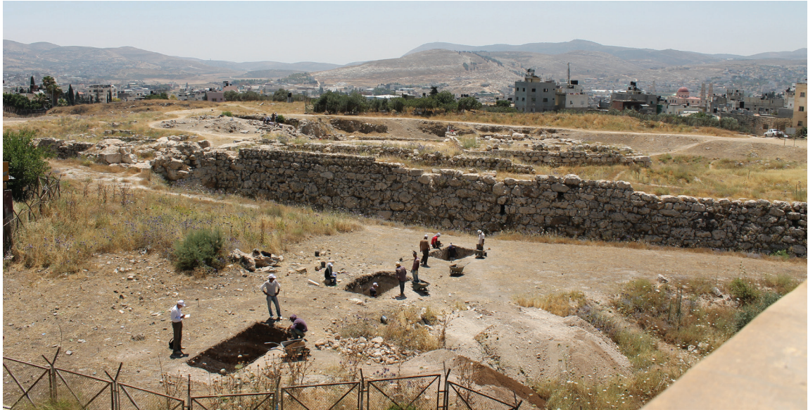
Figure 1. Tell Balata is worth a visit, and some religious tourists and pilgrims do, but the largest part of the international tourists does not leave Israel for a visit to the West Bank region of Palestine (Photo by M. van den Dries, Courtesy Tell Balata Archaeological Park Project).

influenced? The charter itself, nor any other heritage charter, declaration, or professional standard is very helpful in dealing with such complications. In this paper, the situation that we encountered in the West Bank region in Palestine with regard to local heritage consumption, tourism, and the economic benefits will be highlighted and considered in the context of social inclusion and human rights. Discussion on whether archaeologists, site managers, and other heritage professionals could and should do more –apart from trying to implement the principles of our charters and conventions– to try to help improve the situation in difficult countries like Palestine, will also be included in this article, as well as, what the role of the public could be.