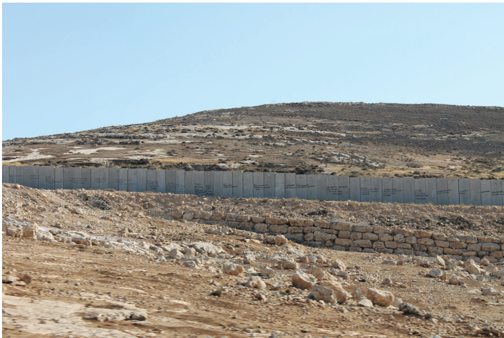
Figure 2. The Separation Wall that is under construction since 2003 will be a 725 km long structure that runs through the West Bank, mostly on territory occupied by Israel. It isolates lots of communities and separates tens of thousands of people from services, lands, and livelihoods (World Bank 2010, 12) and it forms a time-consuming obstacle for travel.

These physical barriers are however not the only obstacles for people to move around. There are also legal impediments. For instance, people living at the West Bank need a permit to visit the place they consider their capital, East-Jerusalem, but these are difficult to obtain (Suleiman and Mohamed 2011: 42). For people living in Gaza the situation is even more difficult as they are not able to leave the area, except to go to Egypt. They are not allowed to travel through Israel or to use the Ben Gurion Airport. In fact, persons with a Palestinian passport (even people who live abroad and who own a second foreign ID-card) are, according