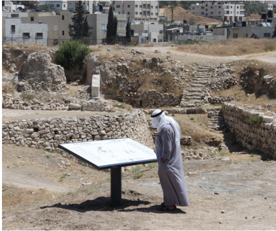
Figure 3. Various measurements are being taken to improve intellectual access to the site and to attract visitors to the Tell Balata Archaeological Park.

and presentation such as the ICOMOS 2008 Charter proposes. Otherwise, we are only paying lip service with our archaeological ethics, our heritage management conventions, charters and standards, and with our human rights resolutions if we sit back and wait further developments. Perhaps we cannot stimulate the physical and economic access for large parts of the Palestinian population, other than by establishing a variety of visitor facilities ( Fig. 3 ) which may create awareness and stimulate further learning, experience, and exploration, but we do not have to stay silent. We should at least point out this social and economic injustice to the world, repeatedly if necessary.