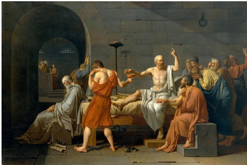
(Jacques-Louis David La Mort de Socrate 1787)