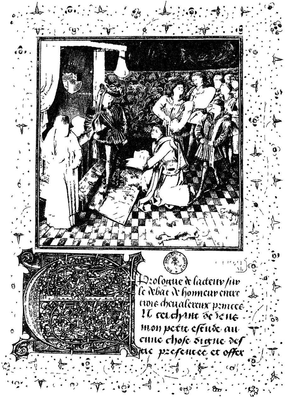
Fig 1 2 Debat de honneur and other didactic works translated around 1450 by Jean Mielot on commission by Duke Philip the Good (KBvB ms 9278-80 f° 1 r)