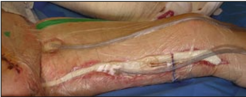
Figure 5: (patient 6). The wound was initially treated with TNP therapy.