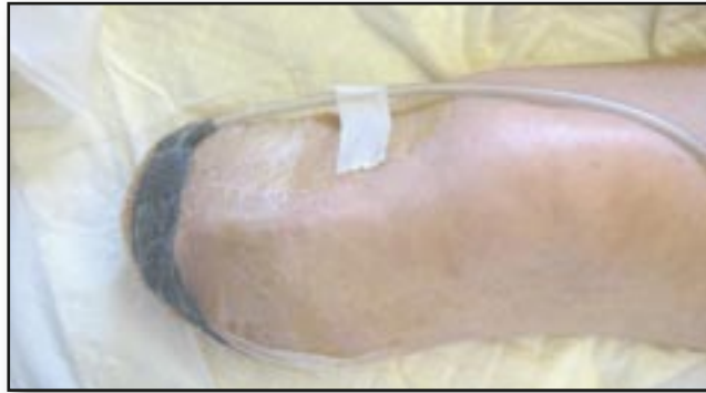
Figure 3: Patient 2. Wound treated with vacuum-assisted closure therapy.

A 71-year-old man with a history of insulin-dependent diabetes was treated in our hospital for an osteomyelitis of the fourth toe of the left foot. The patient was obese and had a history of hypertension, hypercholesterolemia, and a cerebrovascular accident. Angiography revealed a complete stop of the popliteal artery just proximal to the trifurcation. A femoral- pedal bypass seemed feasible, but the infection progressed and we feared a possible infection of the distal anastomosis. Adequate debridement had to be performed first. The toe was amputated. Despite adequate debridement and appropriate antibiotic therapy, a plantar abscess developed, necessitating a transtibial amputation. Unfortunately, this wound did not heal. There was a wound dehiscence with necrosis and pus, but muscles seemed viable. At this time, MDT was started. The maggots were put freely on the wound, covered only by a net, to prevent the maggots escaping. The patient was treated in the outpatient department. After 1 week of MDT (200 maggots used), the wound was fully clean and VAC was started ( Figure 3 ). VAC was also performed in the outpatient department, and after 2 weeks, the wound ( Figure 4 ) could be secondarily closed. After removal of the stitches, the patient started ambulating and is now ambulating well with a prosthesis.