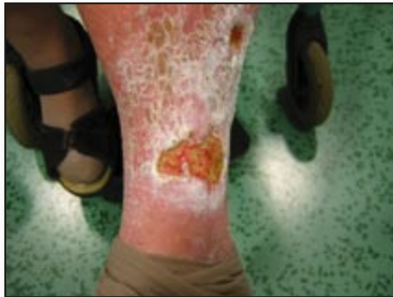
Figure 1: A 93-year old female with an active psoriasis presented with a mixed arterial-venous ulcer that had been present for 6 months.