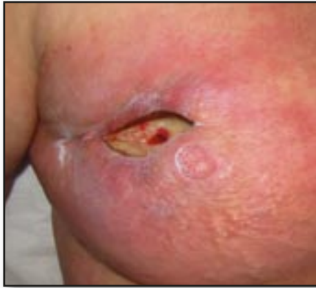
Figure 1: The wound before larval debridement therapy.