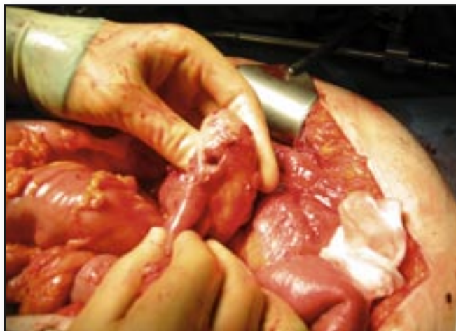
Figure 3: (patient 6). The perforation in the small bowel causing the necrotising fasciitis.