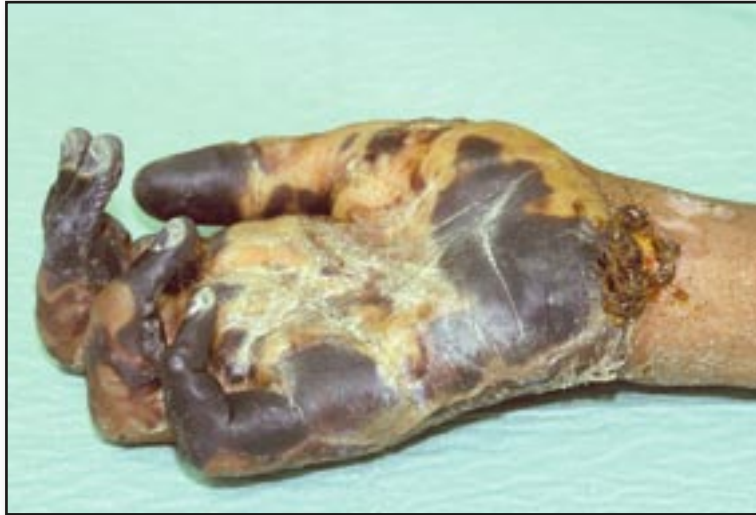
Figure 1: Patient 1. Necrosis of the hand, a sequela of meningococcal sepsis.

was administered 7 times, and additional surgical debridement was not necessary. After 5 weeks, a superficial soft-tissue defect at the top of the partial amputation of the fifth finger of the right hand and the wound on the left foot were covered with autologous mesh grafts. After 2 months, the patient was discharged from the hospital to a rehabilitation center, and at 5 months all tissue defects had healed. The patient is able to walk with a prosthesis, without the help of crutches, and he is able to use both hands well ( figure 3 ).