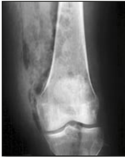
Figure 1: (patient 6). X-ray of the distal left femur showing air in the soft tissues, which is suggestive of necrotising fasciitis.