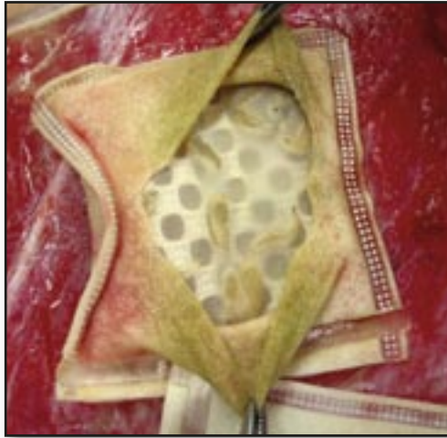
Figure 6: (patient 6). A Vitapad® is placed in the wound.