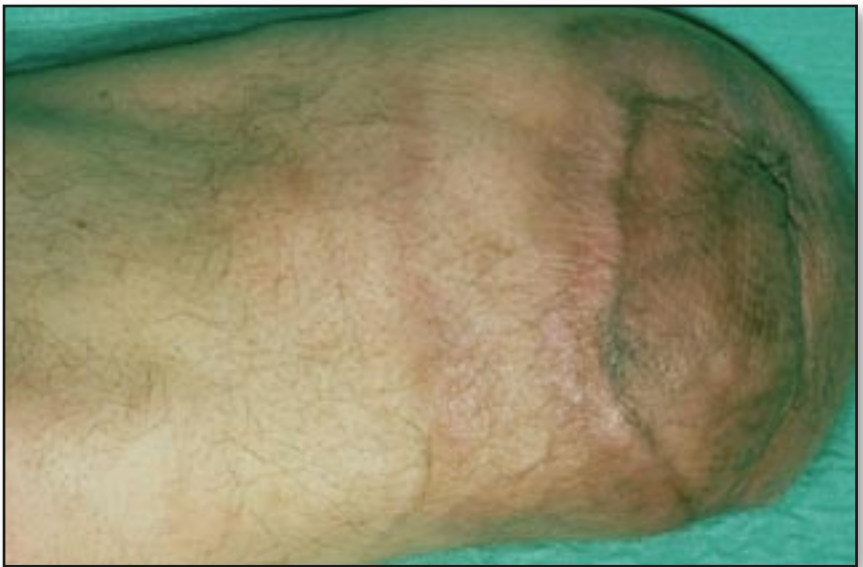
Figure 6: Patient 2. Lower left leg stump at the 1-year follow-up examination.