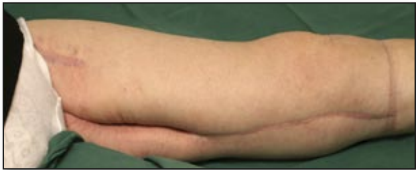
Figure 7: (patient 6). The wound is fully healed.