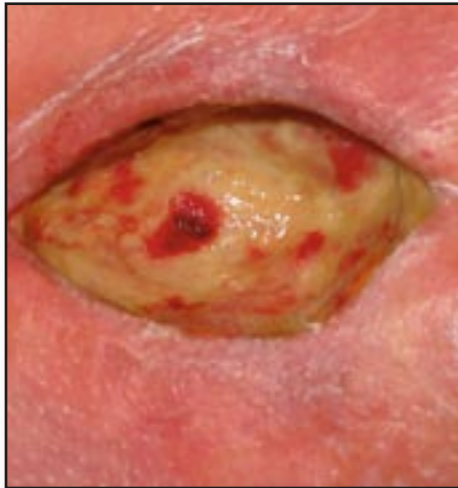
Figure 2: Yellow slough covering the base of the wound.