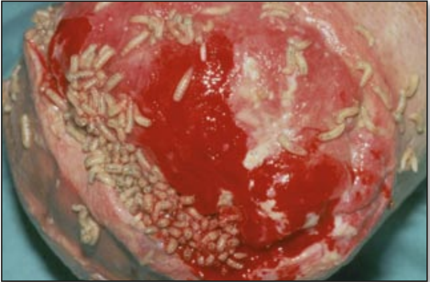
Figure 5: Patient 2. Lower left leg stump: 200–700 maggots were applied directly to the wound surface.