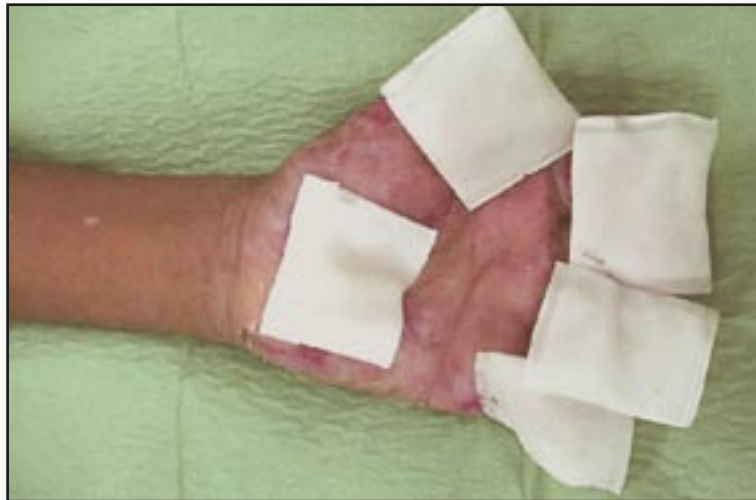
Figure 2: Patient 1. After partial amputation of the second through the fifth fingers, the left hand was covered with 5 “biobags” containing 20–30 maggots each. The porous polyvinyl alcohol membrane of the biobags allows free exchange of secretions and wound debris.