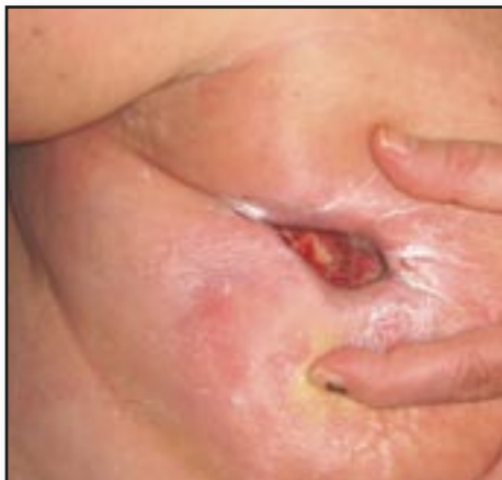
Figure 3: After three applications of MDT, the wound is clean and granulating.