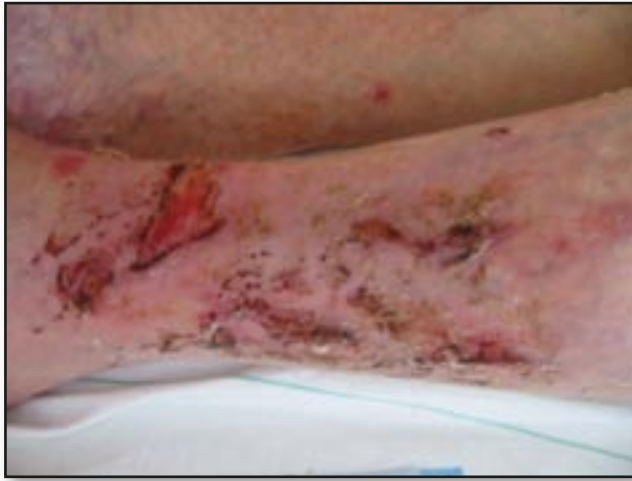
Figure 3: The wounds have a good healing tendency and are reducing in size; more importantly odour and pain are reduced.