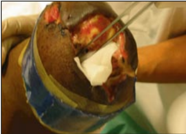
Figure 2: Patient 1. Polyvinyl alcohol bag filled with approximately 20 live maggots is placed in the wound.