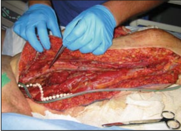
Figure 4: (patient 6). After debridement the wound was left open. Gentamicin beads and a suction drain were placed near the pubic bone. The exposed femoral artery is shown.