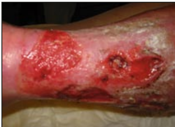
Figure 2: After 3 applications of maggots the wound is clearly fully debrided.