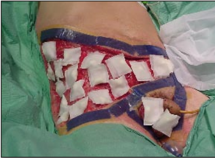
Figure 9: (patient 8). The Vitapads® are placed on the wound. The wound edges are taped with an adhesive tape in order to prevent maggot escapes.