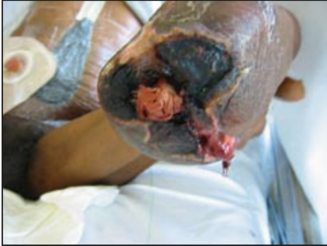
Figure 1: Patient 1. Severely infected transtibial amputation, with necrosis and pus draining on the lateral side. Wet gauze is placed in the marrow of the tibia.

maggots from escaping and prevent further damage to the skin. The total maggot treatment time was 4 weeks, with two weekly changes. In total, 240 maggots were used. Eventually, the wound closed secondarily, and the patient is now ambulating with a prosthesis.