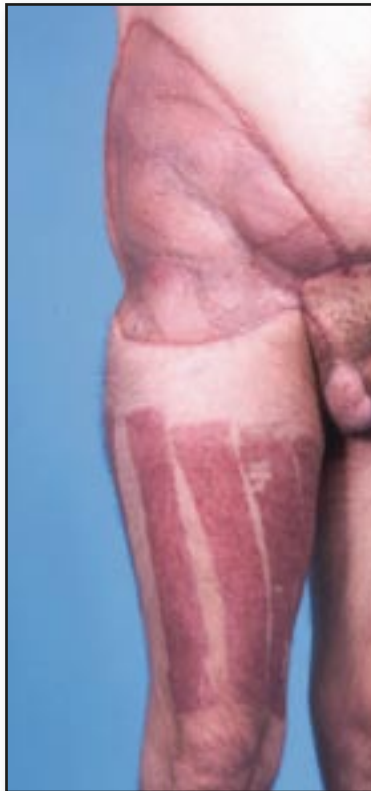
Figure 10: (patient 8). Post-operative end-result after 1 year; the wound fully healed after mesh grafting.