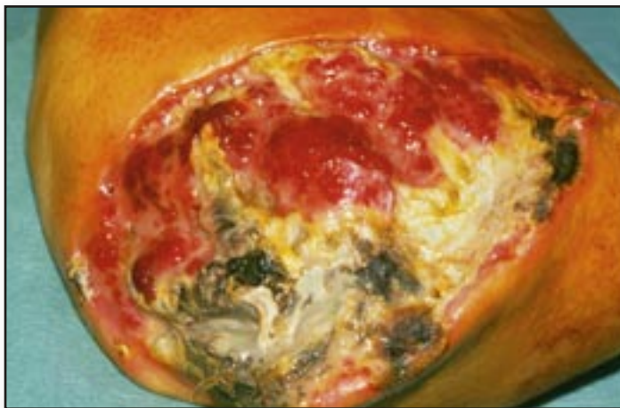
Figure 4: Patient 2. Gangrenous infection of the lower left leg stump.