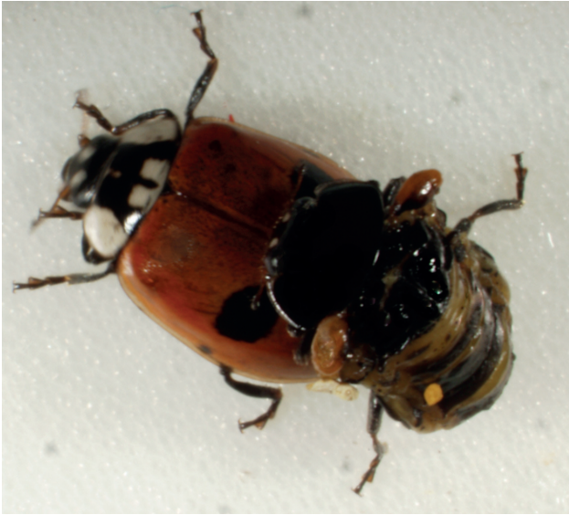
A melanic, wingless male mating a typical, winged female