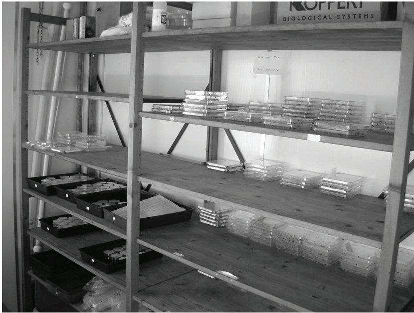
The rearing chamber with beetles in plastic dishes