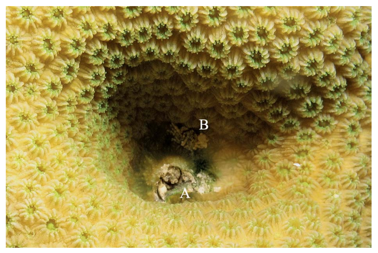
Fig. 2. A female Troglocarcinus corallicola . A , in her lodge inside a colony of the coral Orbicella annularis , with a free-living male; B , residing closely.