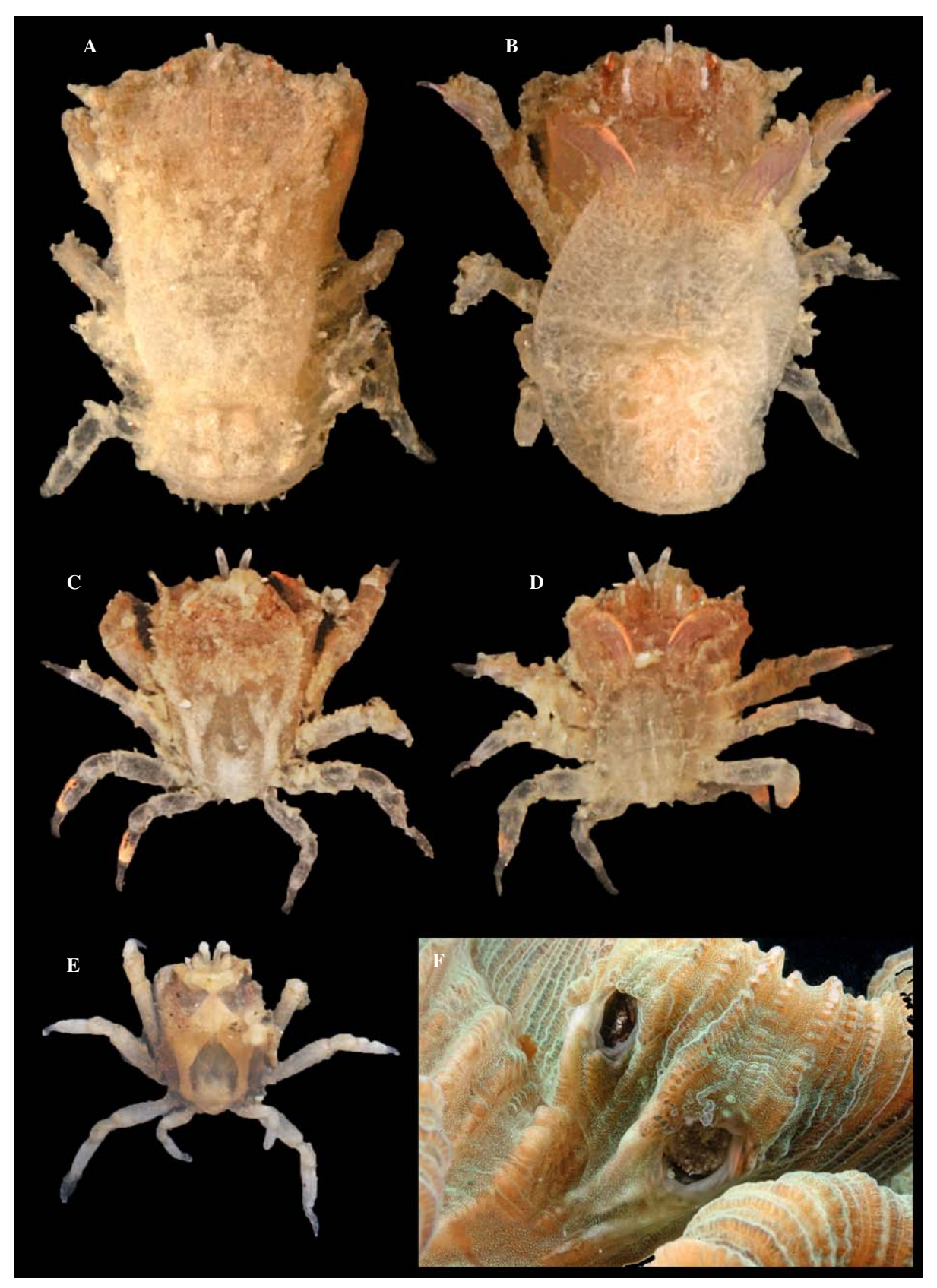
Fig. 3. Colour in life of Lithoscaptus semperi sp. n. A-B , non-ovigerous female (4.5 \times 3.2; RMNH. Crus.D.54258) dorsal view and ventral view; C-D , male (2.5 \times 1.9; RMNH. Crus.D.54258) dorsal view and ventral view; E , juvenile male (2.0 \times 1.6; RMNH. Crus.D.56959) dorsal view; F , in-situ photograph of dwellings (left male, right female) of L. semperi sp. n. in Trachyphyllia geoffroyi on Lubani Rock reef, Kudat (Malaysia).