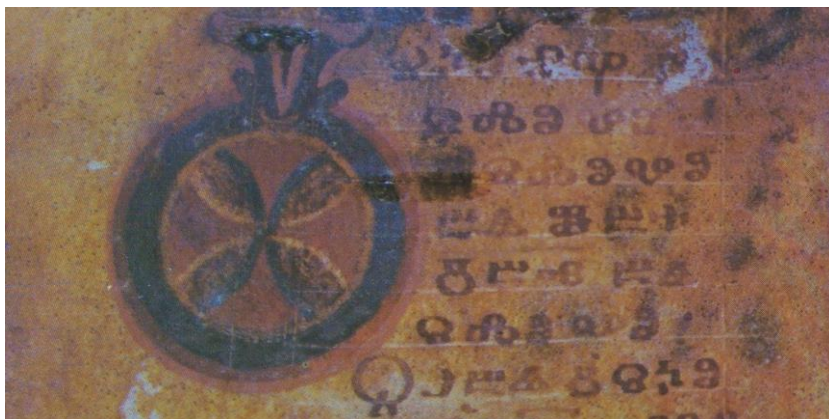
Figure 1.1 Glagolitic fragment, codex Assemanianus (John 1:1)

which is now known as Glagolitic . 5 With the alphabet ready he starts translating the first verse of the Gospel of John, which in the codex Assemanianus looks like this (cf. example (1) in Chapter 0):