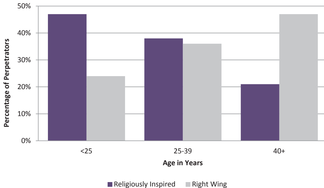
Figure 2: Age Profiles of Ideological Categories.

Variations between age groups were also evident in relation to social isolation and mental-health disorders. The youngest group (younger than twenty-five years old) showed the highest percentage of social isolation at 36 per cent; fewer perpetrators aged 25–39 years old exhibited similar signs (25 per cent); while those aged at least forty years old presented the lowest figure at 11 per cent. Similarly, it is the youngest age group (younger than twenty-five years old) where the highest percentage of suggested mental-health disorder is found (40 per cent).