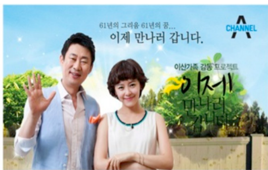
Figure 1: “The longing of 61 years, the dreams of 61 years...now on my way to meet you.”

compelling to audiences now when its very appearance could scarcely have been imagined even a decade ago. Perhaps most importantly, the size and demographic profile of the defector population within South Korea has undergone significant change in recent years. Stirred initially by the disastrous North Korean famine of the 1990s, the number of talbukja arrivals grew steadily to one to two thousand each year between 2002 and 2005, and then climbed to an annual level of two to three thousand in the period between 2006 and 2010. This rapid growth has been accompanied by a marked shift in the gender distribution of refugees. 4 Although the majority of defectors were male up through the end of the twentieth century, as the trickle of those escaping from North Korea grew into a