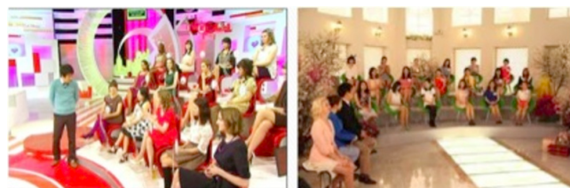
Figure 2: KBS’ Global Talk Show and its North Korea-focused imitator Now on my Way to Meet You .

The format of Ije mannareo gamnida thus operates within a tested formula of chat with attractive women who are intriguingly foreign but able to engage with South Korean society. Personalities emerge with whom viewers are encouraged to form an imagined affective bond through regular contact. Each show’s popular panelists refer upon occasion to their own Internet “cafés,” a specifically Korean type of social media site that allows interaction between celebrities and their fans. Like Misuda , Imangap reflects the growing prominence of young women within South Korea’s societal fabric and its media-saturated consumer capitalism that values youthful femininity as a commodity that can be converted into cultural content (Y. Kim 2011).