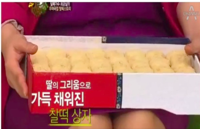
Figure 5: Presentation of a gift to an absent loved one. The caption reads "A box of rice cakes filled with yearning for a daughter."

The presentation of talbuk seonggong narratives also follows a regular pattern; however, the formula differs markedly from that of the defection stories. Rather than sitting in a panelist's chair, the protagonist of the success story stands at a lectern, which is placed apart on the stage, as in a formal talk or a university classroom. Cameras are also positioned differently: for the success story, the main angle is from below and enhances the speaker's authority, whereas in coming from above in the tale of defection and looking down upon the speaker, camera angles intimate powerlessness. Talbuk seonggong stories rarely speak of the time spent in North Korea, whereas a talbuk seuteori is about little else. Instead of a gift for a missing loved one, those who deliver talbuk seonggong narratives, if they display an object at all, show one that represents their bigyeol ("secret to success"). For