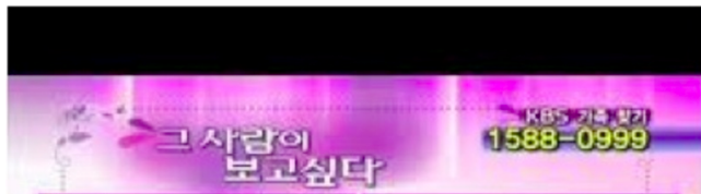
Figure 3: Screenshot of “The Person I Miss” ( Geu sarami bogo sipda ) featuring an American adoptee seeking relatives in Korea

In order now to flesh out observations sketched above, let us consider in detail characteristic segments of Ije mannareo gamnida that demonstrate the show’s strategies in representing North Korea and North Koreans to a South Korean national public. In tracing how the show moves from lighthearted opening to more serious finale, we have chosen to focus first on a close reading of Episode 45, broadcast in October 2012, not least because Channel-A has uploaded a number of segments of this particular show on YouTube and their availability will allow readers to assess our interpretations independently. 13