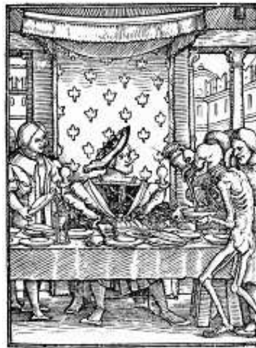
17. (Above, middle) Death and the king (cryptoportrait of Francis I?), from Holbein's danse macabre woodcut series published in 1538: the cloth of honour behind the king appears to feature fleurs-de-lis.