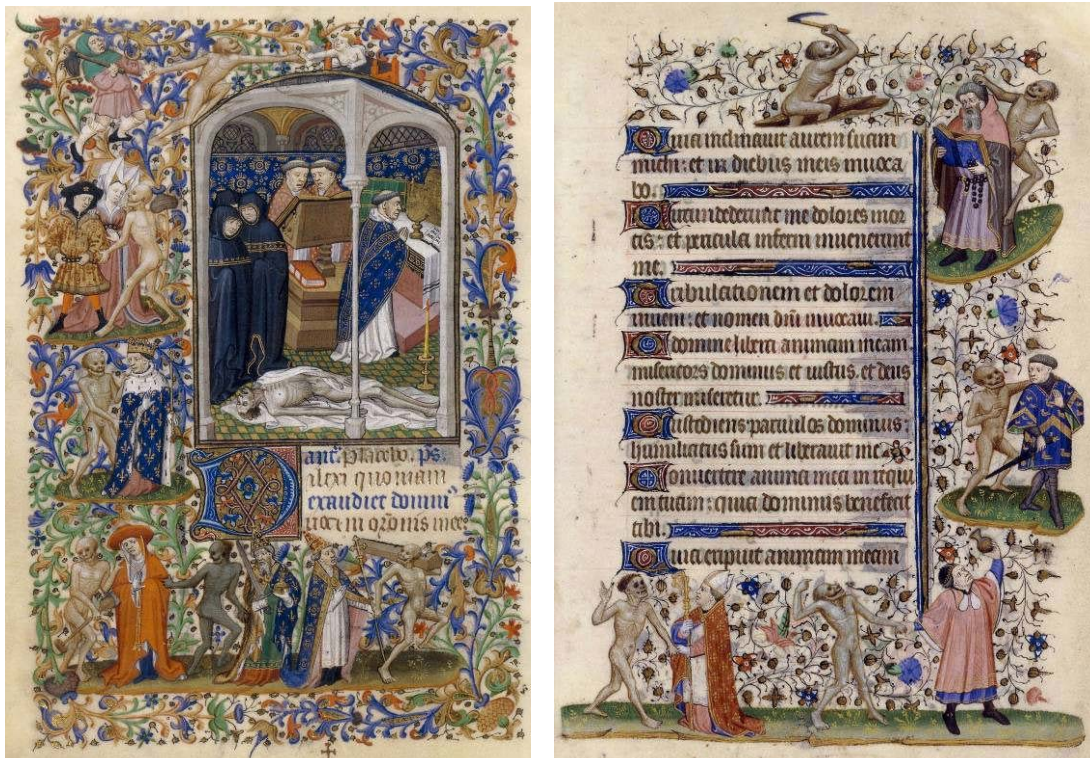
7. Danse macabre as marginal decoration in a Parisian book of hours, c.1430 (Paris, BnF, ms. Rothschild 2535, fols 108v-109r: blank borders cropped in this illustration).

Two extant illuminated books of hours with marginal danse macabre decorations are believed to date to the time of the English occupation of Paris or shortly thereafter, yet both have received surprisingly little attention. 66 The first features elements of the danse as marginal decorations on two of its pages at the start of the Office of the Dead (BnF, ms. Rothschild 2535, fols 108v-109r, Fig. 7 ). The patron is unknown and the attribution of this manuscript is still a matter for debate, but the accepted date is c.1430-40 with a preference for the earlier part of the decade on the basis of dress (see below). 67 The foliate borders of the two facing folios of the Rothschild manuscript illustrate the problem of adapting this mural scheme to a book format. The result is a group of living and dead representatives somewhat haphazardly arranged on several 'islands' strewn with gold flowers not dissimilar to the background of Marchant's woodcuts (Appendix 1). The treatment of the foliate decoration is very different on both pages, with painted foliage on fol. 108v and penwork rincaux on fol. 109r.