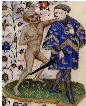
21-22. The bishop (far left) and the knight in a heraldic tabard (left), details of a danse macabre border decoration in a Parisian book of hours of c.1430 (Paris, BnF, ms. Rothschild 2535, fol. 109r).