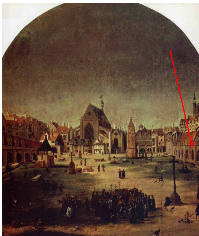
6. (Above right) Church and cemetery of Les Saints Innocents, with the danse macabre mural visible through the arcades on the right, Paris, c.1570, painting by an unknown Flemish master, Paris, Musée Carnavalet.

The creation of the Danse Macabre scheme at Les Innocents had been sufficiently noteworthy to be recorded in the journal of events by the so-called 'Bourgeois de Paris' in the period 1405-49. A Parisian, the anonymous Bourgeois actually belonged to the clergy; he may well have been a canon of Notre-Dame and a member of the university. 23 The Journal , which exists in a number of later manuscript copies (no autograph copy survives), offers a fascinating insight into life in Paris