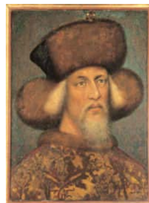
12. (Above) Anon., Portrait of Emperor Sigismund, 1420s, Vienna, Kunsthistorisches Museum.