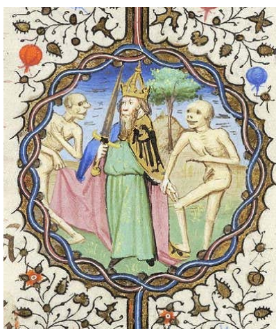
11. The emperor in a danse macabre medallion in a Parisian book of hours of c.1430-35 (New York, Morgan Library MS M.359, fol. 108v).