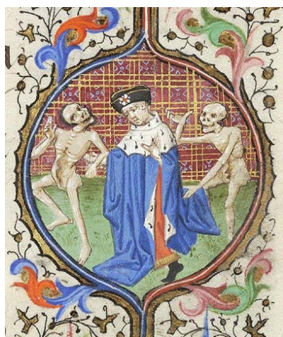
19. The duke in a danse macabre medallion in a Parisian book of hours of c.1430-35 (New York, Morgan Library, MS M.359, fol. 126r).