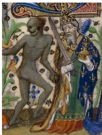
10. The emperor (detail) in a danse macabre border decoration in a Parisian book of hours of c.1430 (Paris, BnF, ms. Rothschild 2535, fol. 108v).

One vital detail in Marchant's woodcut is the emperor's robe decorated with double-headed eagles, a device that Sigismund was to adopt as the emperor's official coat of arms from 1433, though this heraldry had been unofficially associated with the emperor from the thirteenth century on: the colours are always a black double-headed eagle on a gold field ( or a double-headed eagle sable ). 111 In depictions of the Nine Worthies from the fourteenth century on, this heraldry was assigned to Julius Caesar. 112 A bearded and fierce-looking figure of Julius Caesar in a wall-painting of the Nine Worthies of the 1430s in the sala baronale of the Castello della Manta (Piedmont, Italy), recognisable by this traditional coat of arms, is believed to be a cryptoportrait of the then reigning emperor Sigismund ( Fig. 13 ). 113