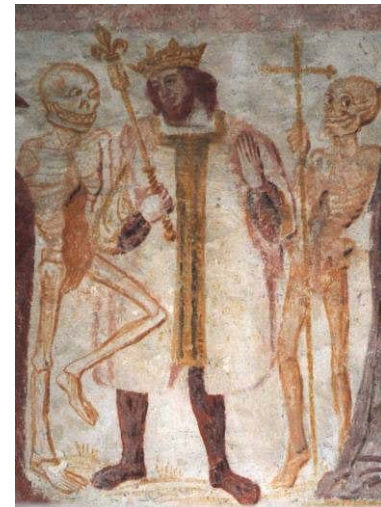
18. (Above, right) Updated figure of the king (cryptoportrait of Francis I?) in the sixteenth-century danse macabre mural at La Ferté-Loupière (Yonne).

The stanzas for the king in the French poem support the above hypothesis, albeit not so much the description of him by the mort as 'Renomme de force et de proesse', which would hardly have suited Charles VI, even if he had formerly been engaged in military activity – he was on campaign against the duke of Brittany in 1392 when struck down by his first attack of madness. At first sight, the king's bitter response to the mort 's invitation appears to be a rare reference to the musical aspect of the Danse , 'Je nay point apris a danser / A danse et note si sauuage', which is echoed by Lydgate as 'I haue not lerned here-a-forne to daunce / No daunce in sothe of fotyng so