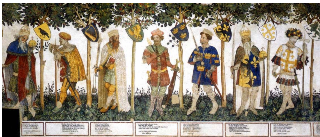
13. Wall-painting of the Nine Worthies (detail), 1430s, sala baronale, Castello della Manta (Piedmont, Italy): on the far left Julius Caesar (cryptoportrait of emperor Sigismund?) and second from the right emperor Charlemagne with his shield hanging on the tree on his right.