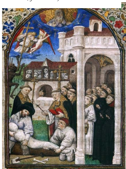
5. (Below) Burial scene in a churchyard with a charnel house in the background, miniature in the Cremaux Hours , French, c.1440 (London, BL, Add. MS 18751, fol. 163r).