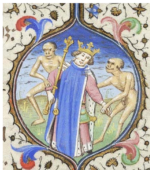
15. The king in a danse macabre medallion in a Parisian book of hours of c.1430-35 (New York, Morgan Library, MS M.359, fol. 125r).

The heraldry in all three images (if we ignore the absence of fleurs-de-lis in the M.359 medallion) indicates that the character was firmly intended to represent a king of France; in the Totentanz tradition his counterpart would have been the German king or king of Rome, i.e. heir to the emperor, albeit not in Knoblochtzer's woodcut where