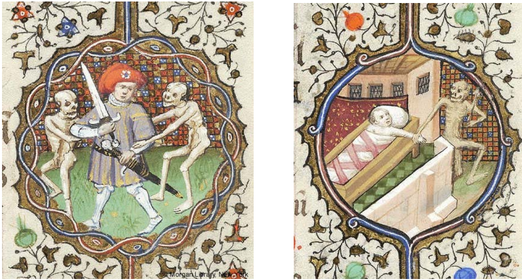
8-9. Danse macabre medallions in the outer margins of a Parisian book of hours of c.1430-35: (left) the constable of France with his ceremonial sword and (right) the infant in his cradle (New York, Morgan Library, MS M.359, fols 127r and 151r).

origin, but it must date from the time of the English occupation as suggested by the inclusion of typically English saints, e.g. St George (23 April) in gold letters. 73