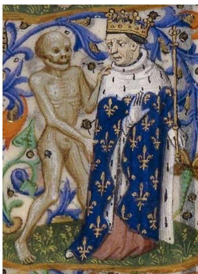
14. The king (detail) in a danse macabre border decoration in a Parisian book of hours of c.1430 (Paris, BnF, ms. Rothschild 2535, fol. 108v).

In both Marchant's woodcut and ms. Rothschild 2535 ( Fig. 14 ), the crowned king wears an ermine collar over a mantle decorated with fleurs-de-lis. Yet whereas the former has shoulder-length hair and a short beard, the latter is beardless with shorter hair and a lined face. The king in Morgan MS M.359 ( Fig. 15 ) is likewise beardless but has rather bland – even stereotypical – features, while his ermine-lined mantle has been left plain blue like the dexter half of the emperor's mantle ( Fig. 11 ).