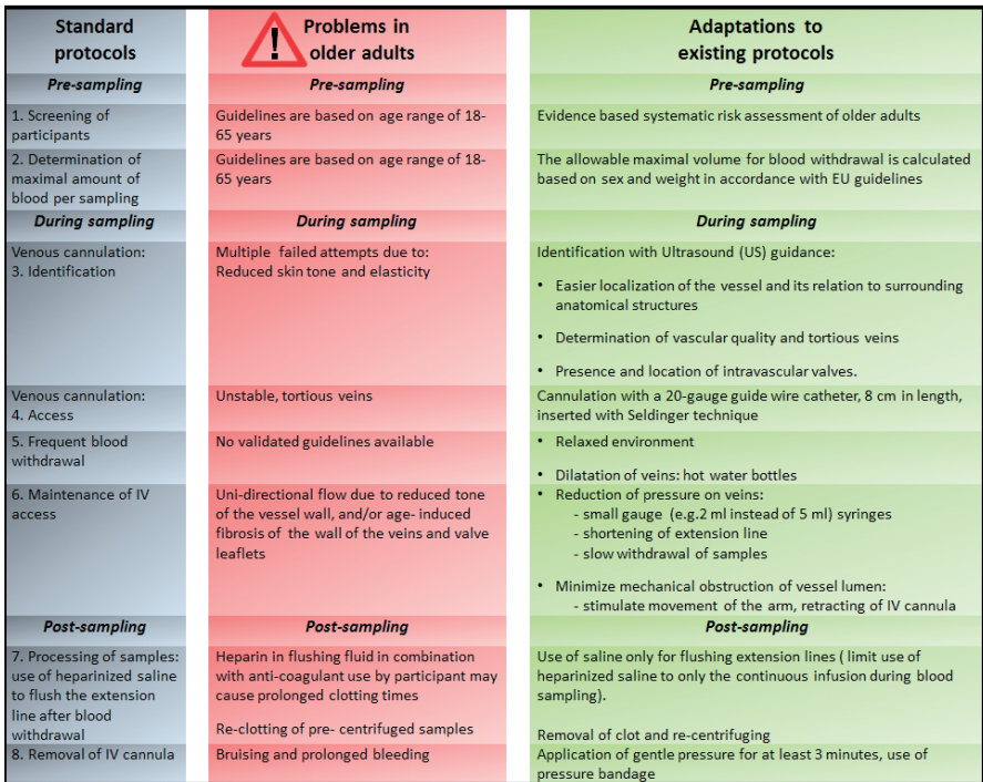
FIGURE | Graphical abstract

Repeated blood sampling, a frequently used method in research, is required for time series analyses of metabolites and/or hormones that show strong fluctuations in blood concentration over time. However repeated blood sampling has a higher failure rate in older adults due to difficulty in establishing and maintaining venous access due to age-induced changes in the integrity of the skin, venous vasculature and valves. Therefore we customized pre-sampling, sampling and post-sampling procedures for continuous sampling in older adults. In our laboratory, the customized protocol was used for 24 hour blood sampling with a sample frequency of 10 minutes in a group of 41 elderly mean (range) age of 66 (52-76) years. With the customized protocol, the mean (standard deviation) number of missing samples was 6.3 (7.0) out of 144 (4.4%) over the whole study period. Thus, the customized protocol that is discussed in more detail below represents a useful and successful method for high frequency sampling of blood in healthy older adults.