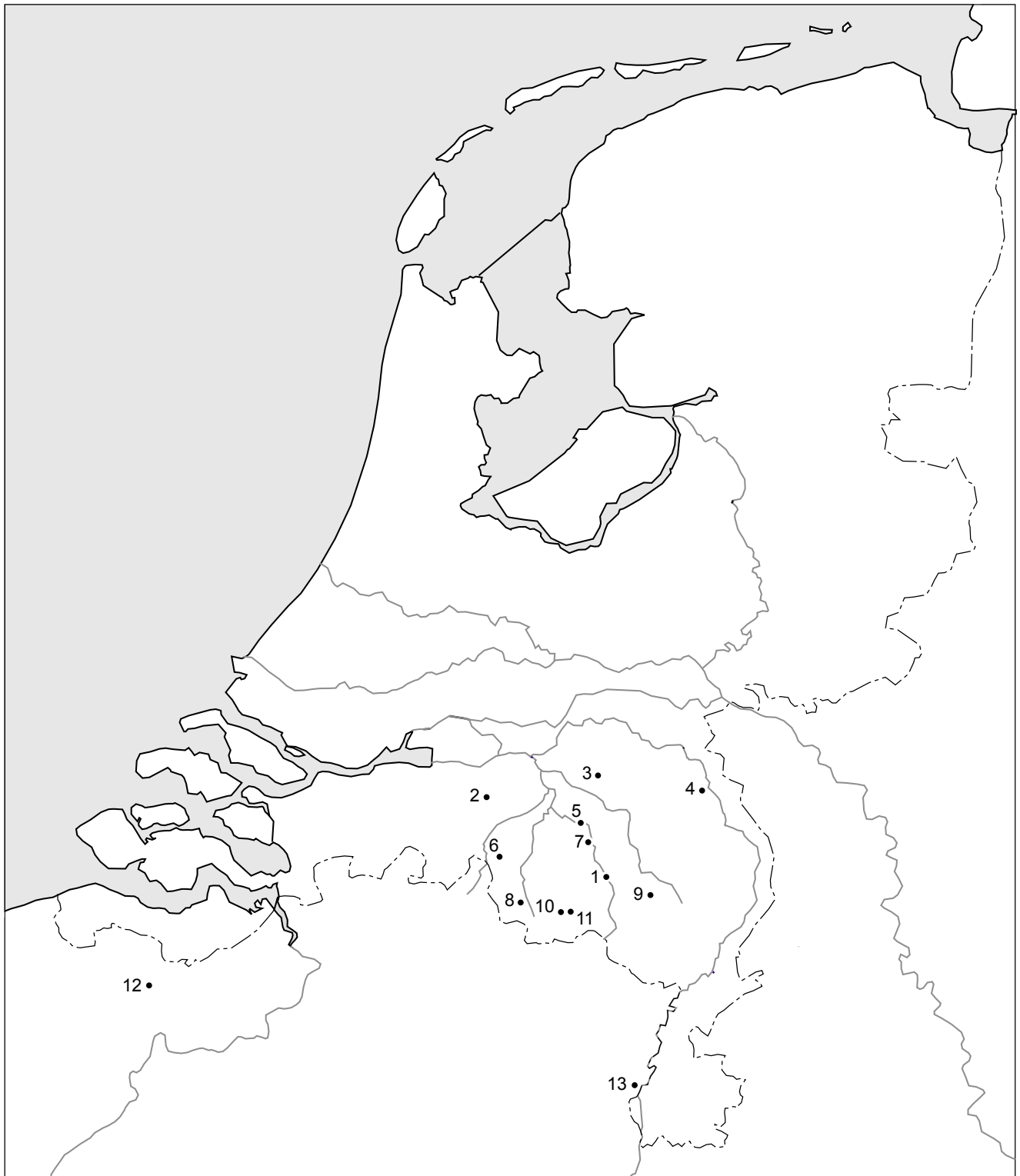
Fig. 4.4 Study area. The sites for the comparison with the site of Geldrop. 1= Geldrop, 2= Loon op Zand, 3= Oss, 4=Boxmeer, 5= Sint Oedenrode, 6= Hilvarenbeek, 7= Son en Breugel, 8= Bladel, 9= Someren, 10= Riethoven, 11= Dommelen, 12= Evergem, 13= Neerharen