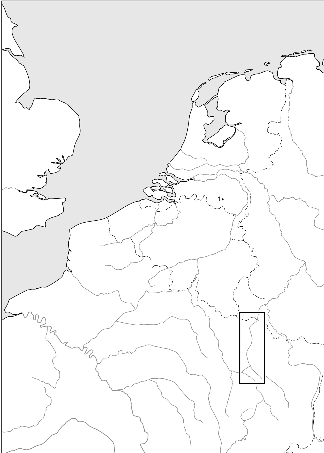
Fig. 4.1 Study area. The site of Geldrop and the Moselle region