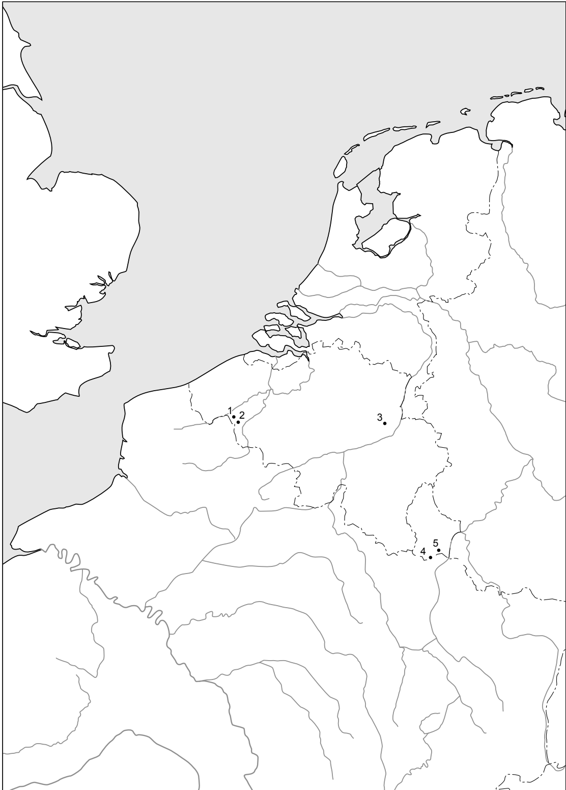
Fig. 4.3 Study area. The sites for the comparison with the locations in the Moselle region. 1= Leuze-en-Hainaut (B), 2= Beloeil (B), 3= Remicourt (B), 4= Düdelingen (L), 5= Weiler la Tour (L)