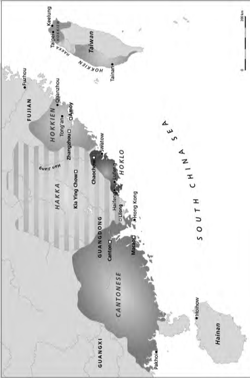
1. Map of Southern China Small squares (□) indicate places where Dutch sinologists studied Chinese dialects. The distribution of Cantonese, Hakka, Hoklo and Hokkien dialects is based on Longman's Language Atlas of China, Map B8.