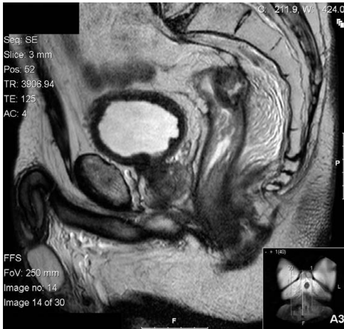
Figure 3.2 MR image of an anastomotic recurrence

the occurrence of those relapses. In these 29 patients local recurrence rate was 12.4% after 5 years, whereas this was 23.6% in T3 or T4 tumors with a positive CRM ( p = 0.217 ). Forty-one percent of these 29 patients had undergone a LAR, 59% had undergone an APR. In tumors operated by LAR with a negative CRM, local recurrence rate was 3.5% in N0 tumors and 12.5% in N+ tumors ( p < 0.001 ). Similarly for tumors operated by APR with a negative CRM, local recurrence rate was 2.0% in N0 tumors and 18.0% in N+ tumors ( p < 0.001 ).