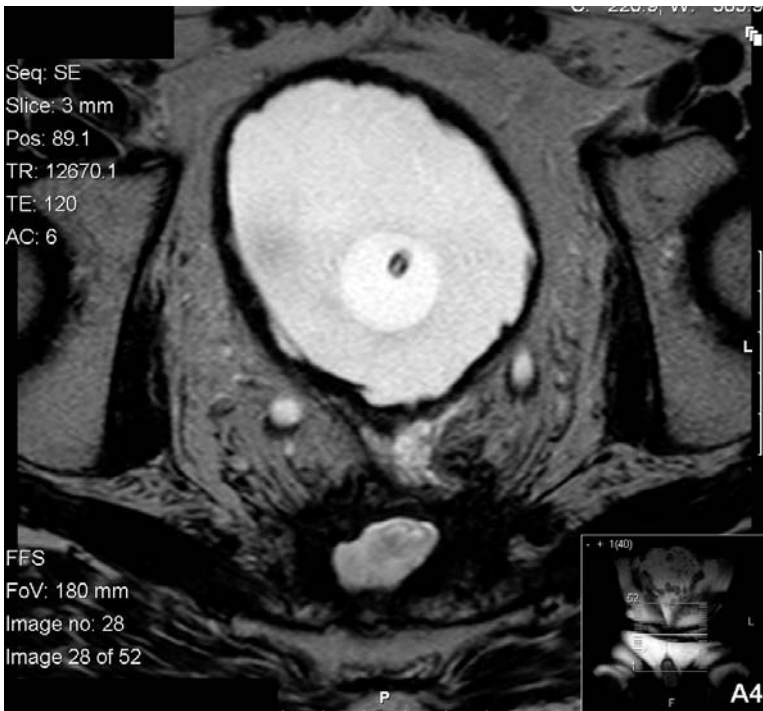
Figure 3.1 MR image of a presacral local recurrence