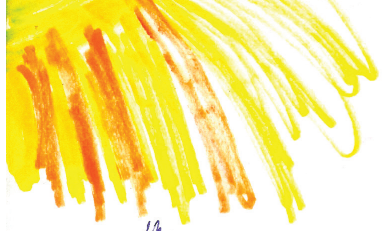
Multi-calorons and their moduli