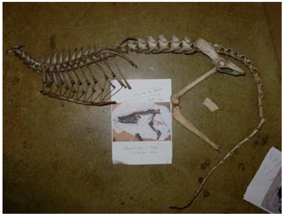
Fig. 3. Ribcage of a leopard at Naturalis next to a picture of the Cameroon leopard ribcage

From a regional perspective there is no evidence of any viable population of either species surviving in Nigeria. There is some information on the existence of cheetahs in the Central African Republic (CAR) and Chad (P. Chardonnet, pers. comm.), and also in Algeria, Niger, Benin and Senegal (Croes et al. 2008). It seems unlikely that cheetahs and wild dogs will be able to migrate from these countries into suitable habitat in Cameroon. The last hope for possible remigration rests with remnant populations in Chad and CAR. Efforts need to be made to regulate the activities of HZMs to improve the conservation of large carnivores like the lion and to prepare for a possible re-migration of cheetahs and wild dogs while at the same time clarifying their role and importance in the ecosystem and helping managers to secure benefits from their presence, such as through ecotourism.