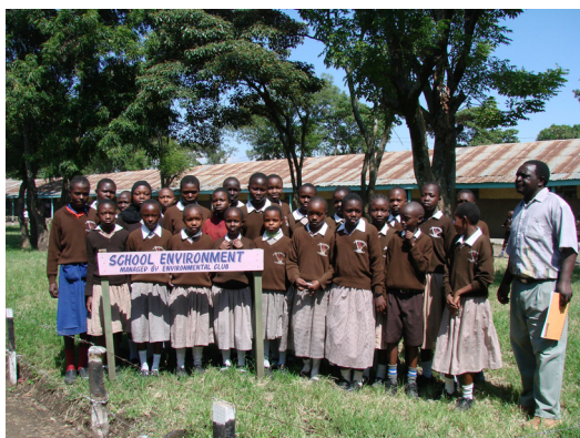
The Environmental Club and its teacher of a public primary school in a low-income neighbourhood of Nakuru

• Leadership. School farming is usually the responsibility of one teacher. This means that the success of the school's farming activities is not only dependent on factors such as land, water and support, but also on individual qualities like a teacher's organizational skill, enthusiasm, dedication, etc., as an example in Nakuru illustrated.