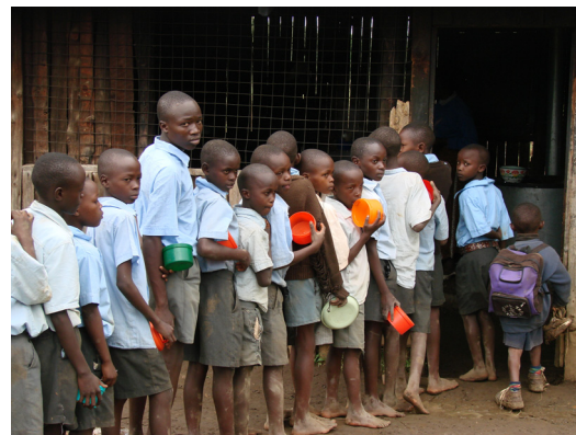
Pupils queuing for lunch at a public primary school in Laikipia District that participates in the Gardens for Life project

of the Gardens for Life project that is currently underway in the UK, India, Kenya and The Gambia. An additional advantage is that pupils learn to grow crops using organic farming methods, which raises their environmental awareness and is potentially beneficial for the urban environment.