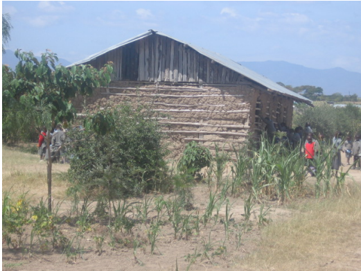
Crops suffering from drought in the shamba of a public primary school in a low-income area of Nakuru

As for livestock keeping, it was more common among secondary than primary schools. Cattle were the most commonly kept animals (in 11 schools). Milk was their most important product. In all cases, some of the milk was used for the teachers' tea and some was sold. In nine schools, the milk was also used for the pupils' feeding programme.