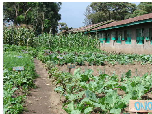
The well-tended shamba of a public primary school in Nakuru participating in the Gardens for Life project

• Sufficient land. 'Not enough land' was by far the most frequently mentioned answer to the question about why non-crop-cultivating schools did not grow crops, while almost half of the schools that did cultivate crops saw their 'lack of enough land' as a serious constraint. Yet, even though the compounds of some schools in Nakuru were indeed (too) small for a crop garden, the data suggested that for most schools the availability of land did not have to be a major constraint to start or expand crop cultivation. The example of Nyandarua Boarding Primary School in Nyahururu (participating in the Gardens for Life project) shows that even a plot as small as one acre can be very rewarding in terms of yield, feeding capacity and (saving) money.