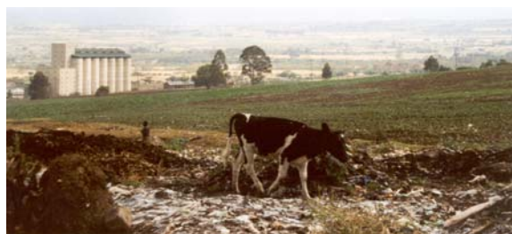
Most of the Nakuru dump is covered with a layer of soil on which maize and beans are cultivated. Both the soils and plants contained high concentrations of heavy metals. On the uncovered part, livestock roam around in the non-separated waste.

The most tangible proof of the impact of the research project is the drafting of Urban Agriculture By-Laws in 2006, which is unique in Kenya and indeed in many other parts of Africa. Based on the recognition that "every person within the jurisdiction of the Council is entitled to a well-balanced diet and food security" and that this entitlement "includes facilitation by the Council to acceptable and approved urban farming practices", farming is now legally recognised as an urban activity. This opens the way for the local government to stimulate the activity among the urban poor – for instance by creating easily accessible zones for farming – as a measure to combat urban poverty.