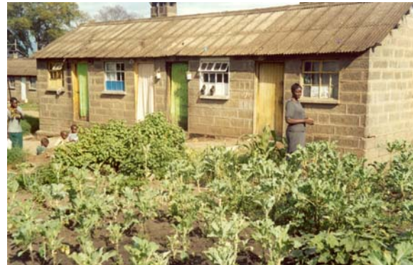
Cultivation of vegetables in front of a one-room house in a municipal estate

Africa's urban areas have been hard hit by declining economies and the resulting structural adjustment policies, the cost of which have been disproportionately felt by the urban poor. Life in the urban areas has become more expensive while employment in the formal sector has decreased and real wages have not kept pace with prices or have even declined in absolute terms.