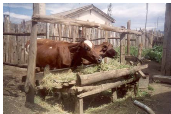
Dairy cows in zero-grazing in a medium-density neighbourhood

The importance of urban farming for a household's food supply was shown during the droughts in 1999 and 2000. Since water is always scarce in Nakuru and most urban farmers have to rely on rainfall, hardly any crops were harvested. As a result, the percentage of poor urban-farming households for whom the activity constituted at least half of their food supply dropped from 60% in 1998 to 20% in 1999. People were forced to buy almost all their food. However, the poor could not afford to purchase all they needed: the percentage of households who did not always have enough to eat in that year jumped from 10% in 1998 (a normal year in terms of rainfall) to 75% in 1999.