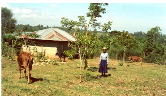
The rural home of an urban resident

Besides farming in town, rural farming activities are equally important for urban households' food supplies. People either cultivate a rural plot themselves (usually the wife) or benefit from the farming activities of family members at the rural home. No less than 85% of the Nakuru population have, in addition to their income-generating activities in the urban economy, such a rural foothold ('multi-spatial livelihood'). The food shortages in the poor Nakuru households in 1999 and 2000 were, therefore, not only caused by failing urban harvests but by bad rural harvests as well.