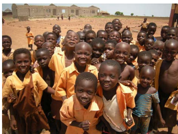
Primary-school children near Gbangu, Ghana

Local history writing is one example of the cognitive changes that beneficiaries have experienced as a result of taking part in a PADev evaluation. Throughout PADev workshops, a story of development, which is a holistic, historical account of the developments the community has gone through, is produced. This story can be categorized as an individual, interpersonal or even collective change at a cognitive level depending on the amount of 'history sharing' involved. An example of a story of development that has been used collectively is its incorporation in the curriculum of primary-school history classes in Langbinsi, which was one of the communities in the study.