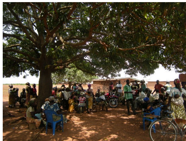
Community meeting in Kasapa, East Mamprusi, Ghana

ples of collective and inter-personal behavioural change processes as a result of participating in PADev.