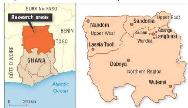
Map: Research areas Northern regions Ghana