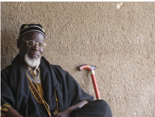
The Chief of Wundua, a participant in the PAdev workshops in Langbinsi, Ghana

Yet respondents mentioned that both the unit committees and the district assemblies lack the human, financial and administrative resources to fulfil their responsibilities. In their opinion, PAdev could help relieve some of the pressure that now rests on the unit committees' shoulders as a three-day workshop would enable them to obtain a holistic idea of the problems that need to be prioritized by the communities and who would be best suited to carry out certain tasks, i.e. the government, NGOs or local community members. Research suggests that some communities have already implemented relevant PAdev findings in their CAPs. Community leaders in Wundua village have, for example, started to use PAdev insights when drawing up their CAP and the Chief of Gbangu village said that PAdev information 'will certainly be used for the CAPs', adding: 'I will gather (the elders) and together discuss (the findings) and try to find issues that need to be worked on'.