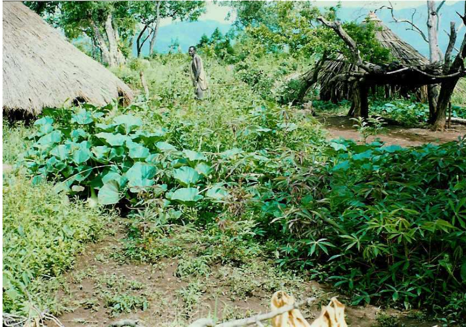
A typical village garden, tended by married women