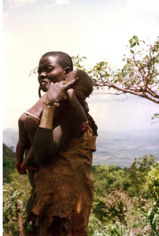
Suri mother and child