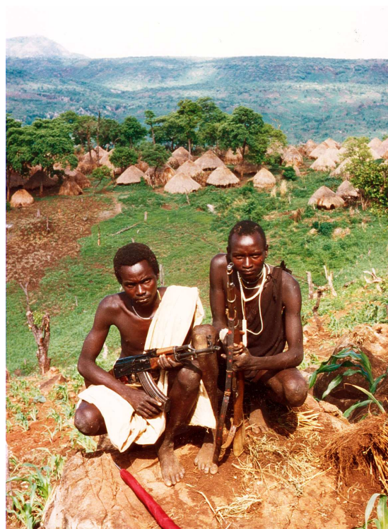
Two armed Suri youngsters