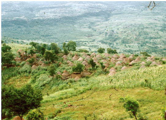
A village in the Suri region of Ethiopia in the dry and wet seasons

In addition to a fascinating case-study revealing a lot about people's social adaptation in times of crisis, both individually and at a household level, this research project yielded interesting comparative insights into social, psychological and cultural responses to the challenges of growing violence, the interaction of culture and local politics, and the fate of smaller ethnic groups caught up in processes of state pressure, globalization and environmental change.