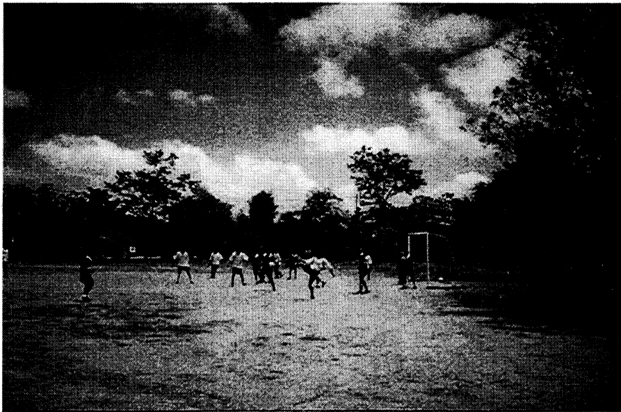
The Malawi social soccer-team

less secretive visit is paid to one of the powerful healers in Malawi. The ones in Gaborone are declared to be ‘charlatans’ as they do no longer represent the pure form of Malawian healing.