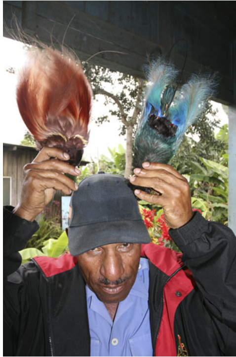
Figure 3. A Mount Hagen policeman showing a Ragianna and Blue Bird-of-paradise skin which he had bought for no particular reason. Does that mean that it was bought for customary purpose or does it mean that it was bought illegally? Either way, the policeman did not seem to care about the (B)BOP trade restrictions at all (Mount Hagen, Southern Highlands Province, PNG, June 2008;).

were proud these birds occurred in their area as they are unique to PNG and because BOP are PNG's national symbol. As a response to these conservation incentives, several interviewees indicated that they tell their children they should not to hunt too many BBOP and should not cut trees unnecessarily, while they claim to act accordingly themselves.