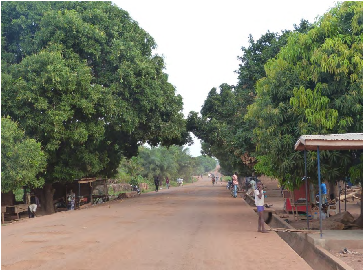
Fig. 2. Some of the remaining mangoes on the street in Kpandai. Note, to the left of the main road the old trees close to the Roman Catholic Mission House and to the right are new ones planted after the 1991 war.

Nawuri-Gonja conflict of 1991 and 1992. 23 Other trees were also cut down in the later part of the 1990s when Kpandai was connected to electricity from Akosombo hydro-electric dam. 24 The remaining trees could however be found in and around the Roman Catholic mission, and other parts of Kpandai.