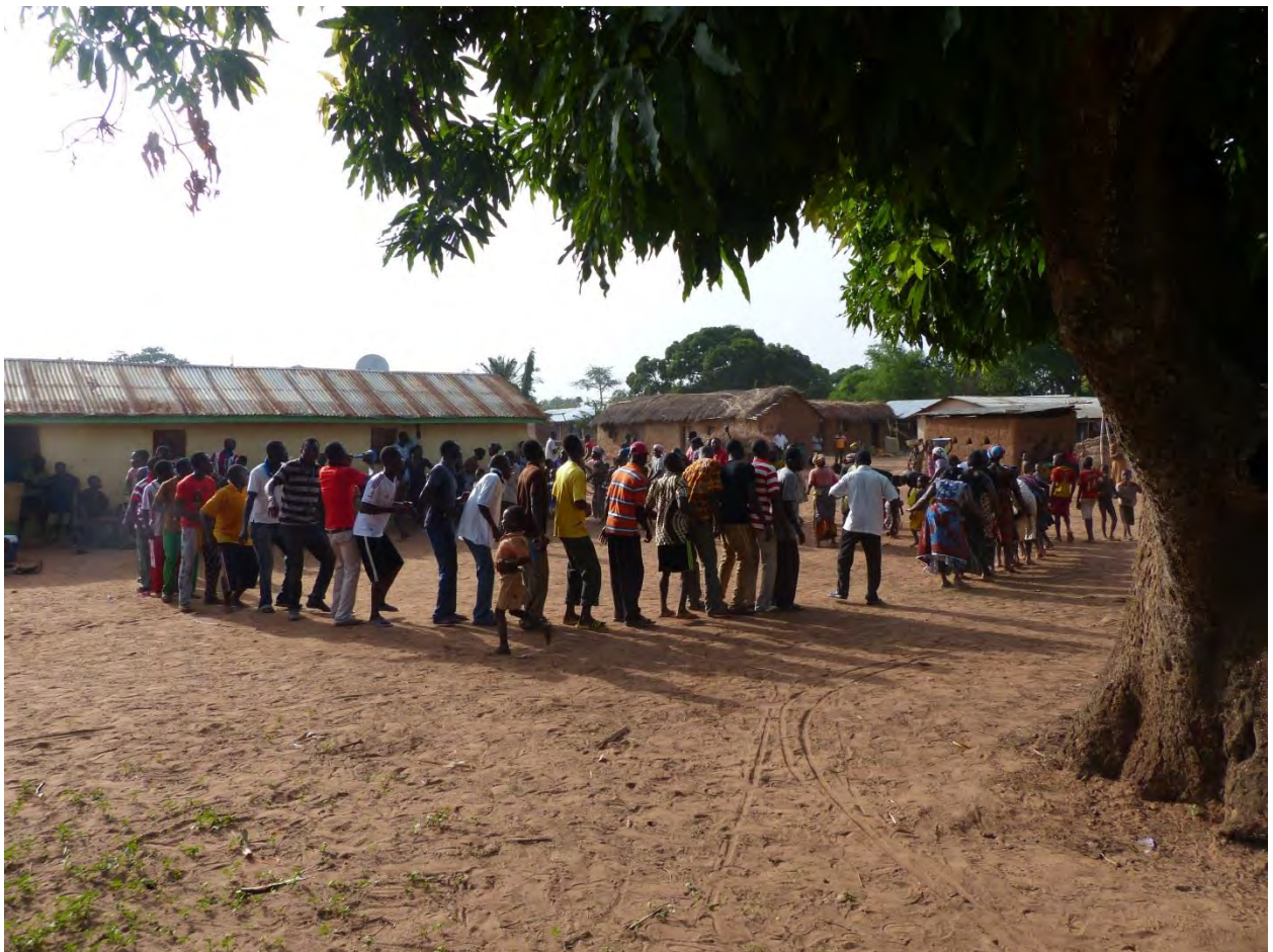
Fig. 3 above and Fig. 4 below. Balai community members in two traditional dances under mango trees. Above is the Baya dance and below is the 'Hunters Dance'- Kakpancha .

Finally, funerals were also often held under the trees. Often traditional dances such as Kakpancha , baya , kake were and are still performed under the trees. In the same manner divination, which forms part of the final funeral rites of Nawuris end up under the trees.