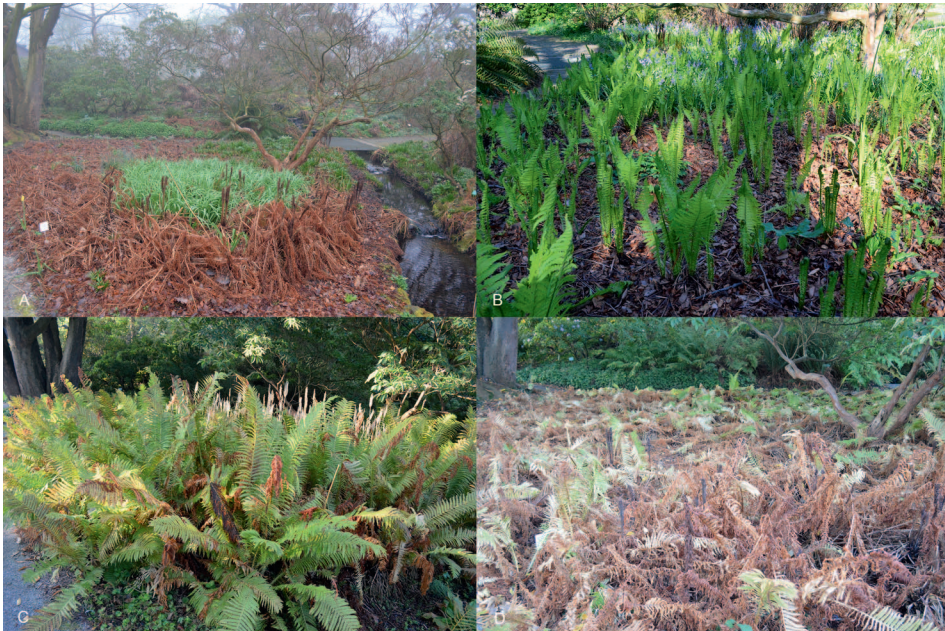
FIG. 1. Seasonal changes in the aspect of the sampled Matteuccia patch in the Hortus botanicus Leiden in the sampled period. A – March 14, B – April 16, C – September 17, D – October 20.

As M. struthiopteris is a source for edible fiddleheads, which are commercially harvested from the wild (DeLong and Prange, 2008), some experiments have studied the effect of complete removal of croziers (fiddlehead harvest). Bergeron and Lapointe (2001) found that starch was the main form of carbohydrate reserve in trophopods when measured at the end of the growing season, and that complete defoliation early in the growing season could reduce this starch content by 88%.