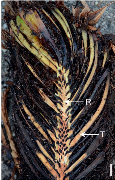
FIG. 2. Approximately medial longitudinal section through a crown of Matteuccia struthiopteris . R: rhizome, T: trophopod, scale bar 1 cm.

separate samples were analyzed because not all sampled crowns were robust enough to support the removal of four parts at different levels. Our intention was that by sampling in this way, the samples from the middle and upper level would correspond to the trophopods remaining from leaves that had abscised the previous year, lower-level trophopods to those from earlier years, and the uppermost ones to represent the metabolically most active part of the plant. In the months February to September the parts marked G corresponded to the dormant buds formed the previous year and the expanded leaves, in the months October to January these were the dormant buds formed during the sampling period. We did not distinguish between trophopods of foliage leaves and cataphylls, and whenever possible, we tried to avoid sampling from fertile leaves that are non-assimilating and therefore can be expected to have a different starch metabolism. The total number of well-developed crowns in the patch did not allow us to sample entire crowns destructively. Accordingly, some crowns may have been sampled repeatedly at different times, and the assignment of trophopods to categories L, M or H may have had some degree of arbitrariness.