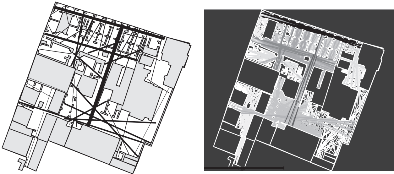
Fig. 3. (left) Axial connectivity graph, ranking of integration is indicated by thickness of lines; (right) Visual axial line integration, visual lines converge in passages and courtyards.

general trends and problems in the archaeological application of Space Syntax methodology have been discussed elsewhere 20 . Space Syntax is built on two formal ideas, which try to reflect both the objectivity of space and our intuitive engagement with it. First, space is an intrinsic aspect of all activities that human beings do. Secondly, human space is not about the properties of individual space, but about the interrelations between the many spaces that make up the spatial layout of a building or a city, the configuration of space 21 . Thus all human activities have a necessary spatial geometry: movement is linear, interaction requires a convex space in which all points can see all others, and from any point in space we see a variably shaped visual field, called isovist 22 .