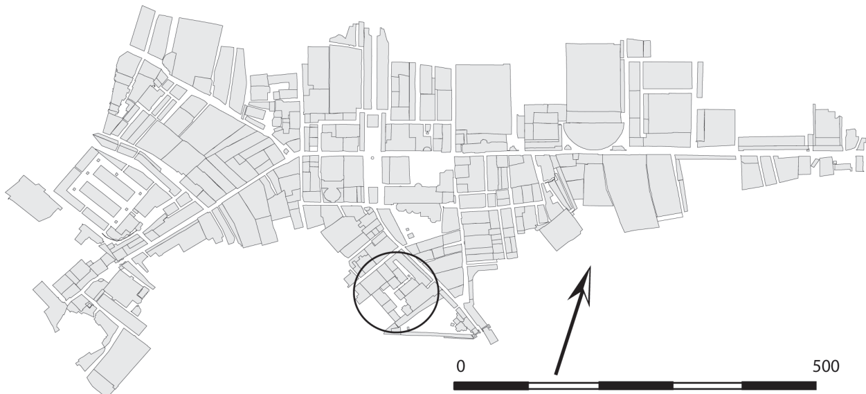
Fig. 1. Ostia's built environment within the excavated areas. The circle marks insula IV ii.

The insula is characterised by diverse land-uses, representing a built environment that potentially accommodated commercial, recreational, sacred, communal and habitation space within its confines. These spaces were not only linked functionally, but also through a structural relationship provided by