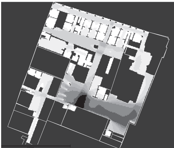
Fig. 4. Point map connectivity of visual lines.

Depthmap line analysis, calculated for axial connectivity based on the longest visual lines, identified the visual line reaching from the portico to the second courtyard as the most integrated line, followed by the visual line along the street-front of the portico. The line ranking third runs along the first courtyard. Clearly the courtyards are converging points for visual lines from all directions, making the courtyards the prime spaces for social encounter (Fig. 4). Interestingly enough, the fountains located within the courtyard were placed in a way so as not to obstruct long visual lines.