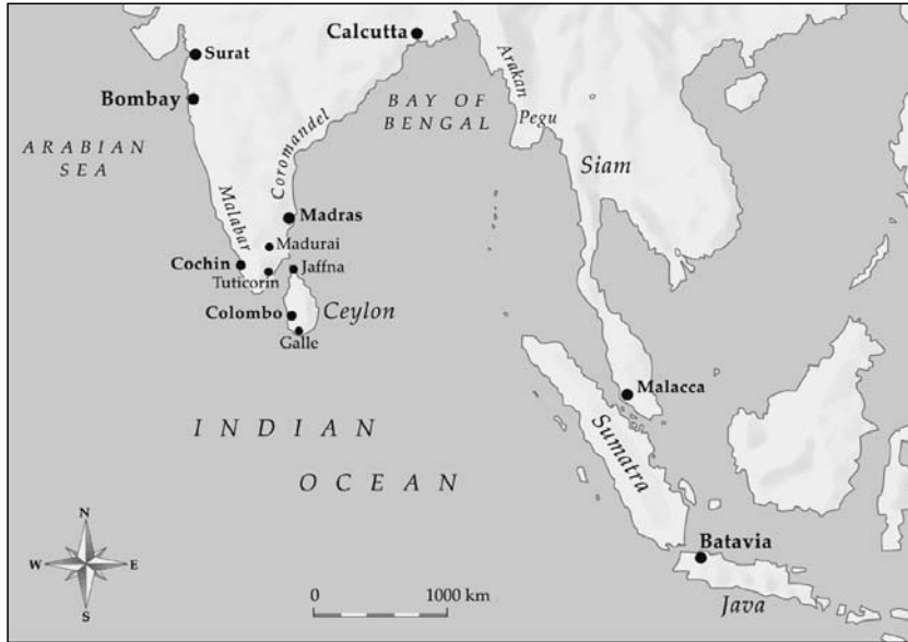
Map of South and Southeast Asia