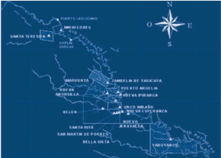
Map 1. The titled native communities in the Teniente Manuel Clavero District

Source: Detail adapted from the map "Territorio de las Comunidades Nativas Tituladas del Río Putumayo", Information System on Native Communities of the Peruvian Amazon (SICNA), Instituto del Bien Común (April 1998). The map was adapted to the actual ubicacion of the communities of Bellavista, San Martín de Porres and Santa Rita.