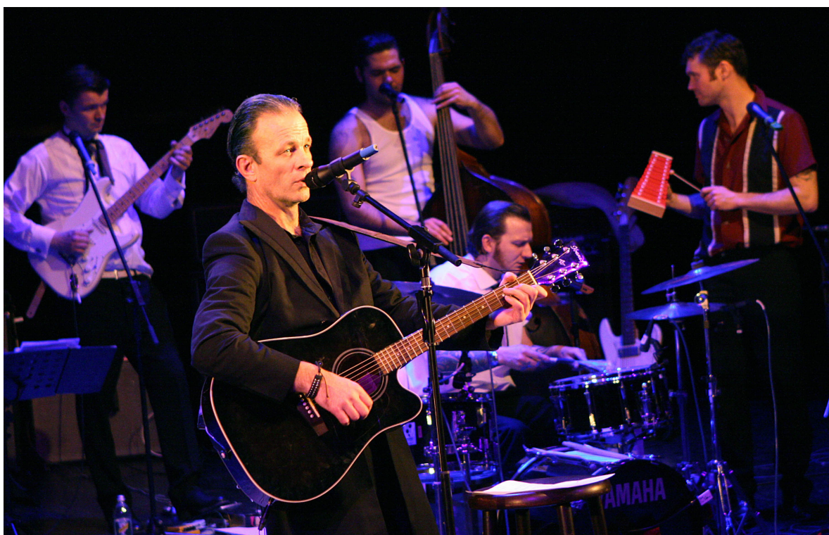
Image 3.1: Johnny Cash (2008), Bochum city theatre, direction Arne Nobel

A similar approach to working with musicians is made frequently in (dramatic) theatre plays where musicians play live music. In nearly every such theatre production there is a choice of costumes; not only for the actors but for the live musicians as well, who generally do not play in a pit, but are present on stage. The costumes might bear theatrical effects in themselves, but more importantly, they set the musician in the context and framework of the play. The five musicians in the "musical evening" 93 A Tribute to Johnny Cash (2008, Bochum city theatre, direction Arne Nobel) are dressed in a way which perfectly and smoothly blends with the outer appearance of the actor who plays Johnny Cash himself. Both the actors and the musicians wear country and western clothing (image 3.1). The musicians function as characters inside the world of the evening without necessarily doing much more than playing their instruments. In one possible basic interpretative layer, the musicians might simply be seen as the band of Johnny Cash: the musicians that would have been accompanying him in "real life" anyway.