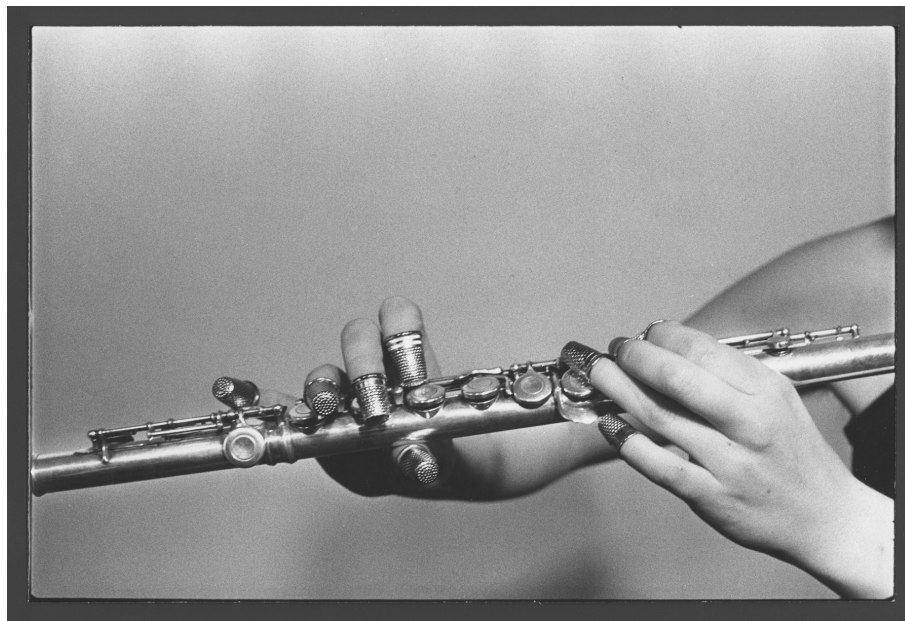
Image 0.2: Christina Kubisch, Emergency Solos - In Touch With (1974/75)

As yet there are only few examples where the performer is specifically involved in reduction. Here, I will restrict myself to two examples: Dieter Schnebel's nostalgie for solo conductor and the Emergency Solos by Christina Kubisch. In nostalgie (1962) the orchestra and its entire presence and sound are literally taken away from the conductor, so that he conducts an imaginary orchestra. In Emergency Solos (1974/75) 14 , German composer, visual and sound artist Christina Kubisch uses a variety of objects (thimbles on her fingertips in In Touch With , a gas mask through which she plays the instrument without mouthpiece in Week-End , a condom stretched over the flute in Erotika ) to make the playing of the instrument almost impossible. The objects lead to a self-reflective comment on the nature of musical performance and to a "re-evaluation of the visual dimension, which is equal to the musical [dimension] in these performances." (Sanio 2004: 9, my translation) 15 The musician is denied the possibility of a "proper" performance, and it is just that what transforms the flute player into a theatrical performer.