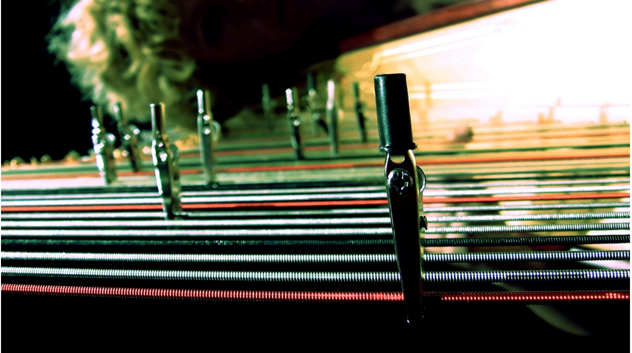
Image 4.8: Living Room , still from the video part of the fourth section

screen. Only in the final section of Living Room , the live and video harpists finally perform a duo of complementary, rhythmically intersected passages of chords and harmonic motives. The performance ends with the harp player preparing her harp with more of the same objects that were previously visible in the film, finishing the imaginative time-circle, in which the harp player prepares the instrument for the film-shooting of which the audience just saw the result.