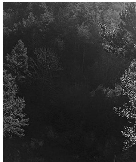
Awoiska van der Molen, #274-5, silver gelatin print

But, as Geoffry Batchen has argued, it is only this view of the temporal dimension of photography in terms of the moment that belongs to the past that makes understandable why we sometimes feel extremely uncomfortable when we look at photographs. Looking at photographs can make us aware of the fact that time passes because the represented moment belongs to the past. Ultimately, every photograph predicts our death. But this view does not explain why we want to look at some photographs again and again. This attraction is not generated by the viewers' macabre necrophiliac fascination. On the contrary. Batchen argues that the reputation of Barthes' Camera Lucida is based on a one-sided reading of it. Barthes, he says, would have written his book from a fascination for that which is dead but is represented in such a way that it comes to life again.