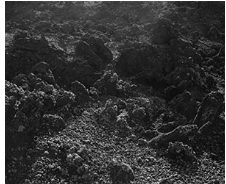
Awoiska van der Molen, #326-5, silver gelatin print

Her use of analog photography and the traditional processes that are part of it, could create the impression that her images result from nostalgia for times in which digitalism was not yet predominant. The continuously increasing stream of images to which we are exposed today and the massive consumptive and exhibitionistic use of photography made possible by digital technology would then account for a counter response, a return to times when photography was still respected. Instead, I contend that the photographic practice of Van der Molen should be seen as a critical reflection on the medium of photography, a reflection that is necessary today because the taking and distribution of photographs has become an obsessive and compulsive, hence unreflected, ritual. In the terms of Brazilian theoretician Vilém Flusser, one could say that Van der Molen makes visible 'the program of the medium photography'.