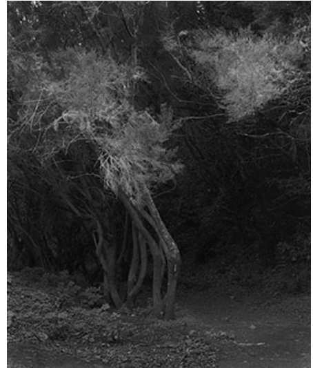
Awoiska van der Molen, #351-10, silver gelatin print, courtesy of the artist

Long durations such as those of Hsieh's lifeworks can be contrasted with the temporality of eventhood ascribed to much performance work. Extended duration lacks the distinction that separates the event from the mundane, the everyday: the bracketing off and casting out of experience into the domain of the "uneventful" through which the event, as heightened experience, must necessarily be constituted. 2