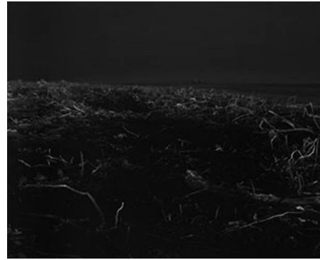
Awoiska van der Molen, #202-10, silver gelatin print

The landscapes of Van der Molen are a combination of these two extremes of pure nature. They are like paradise as well as sublime, because they look most like the way we imagine nature to have looked after creation. The creation of earth and heaven described in Genesis 1, takes several days. God makes distinctions between light and darkness, between sea and land. It is clear that it is a laborious job for God to make these distinctions. Again and again there is a moment of rest and contemplation in which he looks back at what he has just created. The famous words: "And God saw that it was good" return like a refrain, closure of a busy day on which a lot of work has been done. Again and again Van der Molen's landscapes seem to represent this moment of rest after a process of creation. The undefined temporal dimension, between day and night, contributes to this effect. It always concerns a transition, a moment of rest within an overwhelming process. What we then see, or what we look back to is like paradise because it is untouched. The term