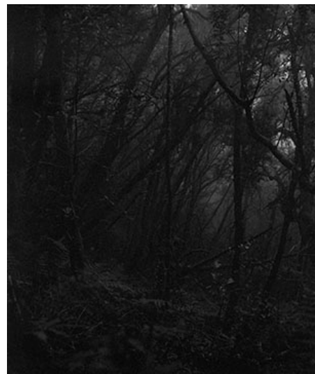
Awoiska van der Molen, #343-18, silver gelatin print