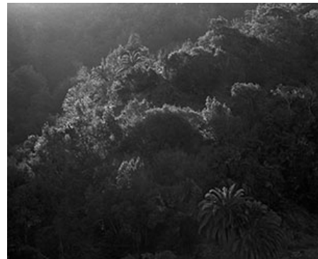
Awoiska van der Molen, #346-18, silver gelatin print

When we stand in front of the photographs of Awoiska van der Molen it becomes clear immediately that this characterization of the two media is too simple. Although we see again and again landscapes of mountains, trees, leaves, or stones, it is especially in the temporal domain that we are immersed. In her work the tangibility of time seems at first sight to be the result of the technical processes she employs. The landscapes, mostly taken during the night or early morning, are made with shutter speeds of almost fifteen minutes. And then follows the meticulous process of printing on barite paper, which also requires a lot of time. This sequence of slow processes is later readable in her work and explains the tangible slowness emanating from it. Yet, this explanation is too easy. For the procedures underlying these photographs might only be readable indexically, and only for experts, who are still familiar with the craftsmanship of analog photography. The tangibility of time in