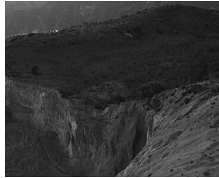
Awoiska van der Molen, #323-7, silver gelatin print, courtesy of the artist

habitation or activity is visible. What the earlier works have in common with the more recent ones is the 'uneventfulness' I have mentioned. The lack of events and specific moments seems to be combined with the spaces she selects for her photographs: landscapes. Again, it is Bergson who offers possibilities to understand the kind of space central in Van der Molen's work. According to Bergson space is not geometrical, as in the case of Renaissance linear perspective. When space is not geometrical it cannot be measured, and it is not identical for all those who are in that space. Our relation to space develops according a 'natural feeling'. So, like duration, space cannot be itemized or measured. In his book Time and Free Will he calls space an extension emanated from the subject. 11