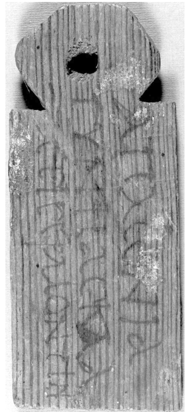
Mummy Tag, inv. N 2004