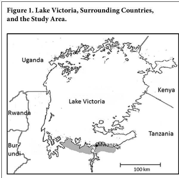
Figure 1. Lake Victoria, Surrounding Countries, and the Study Area.

S. haematobium is < 3% in adults in the same villages (3,17–20)95% confidence interval [CI] = 1.2–13.5. HIV is also prevalent in these villages; a 2004 study showed that 8% of adults greater than 15 years of age were HIV-infected (21). The major mode of HIV transmission is heterosexual intercourse, and there are more females than males infected, with a female to male ratio of HIV infection of 1.2:1.0 (21).